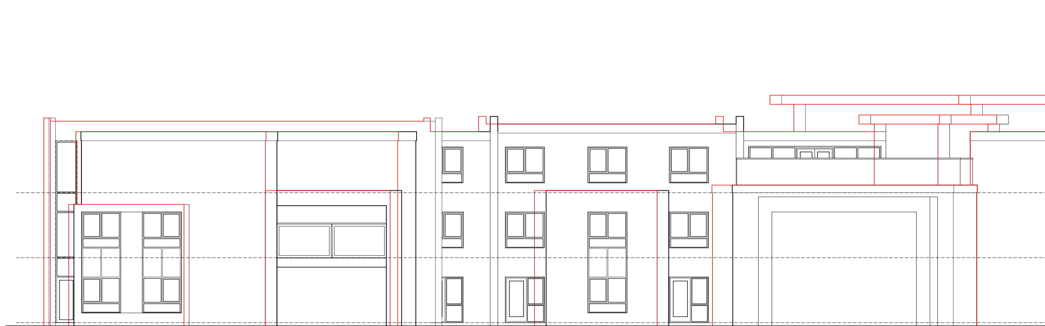
Proposed Elevation B