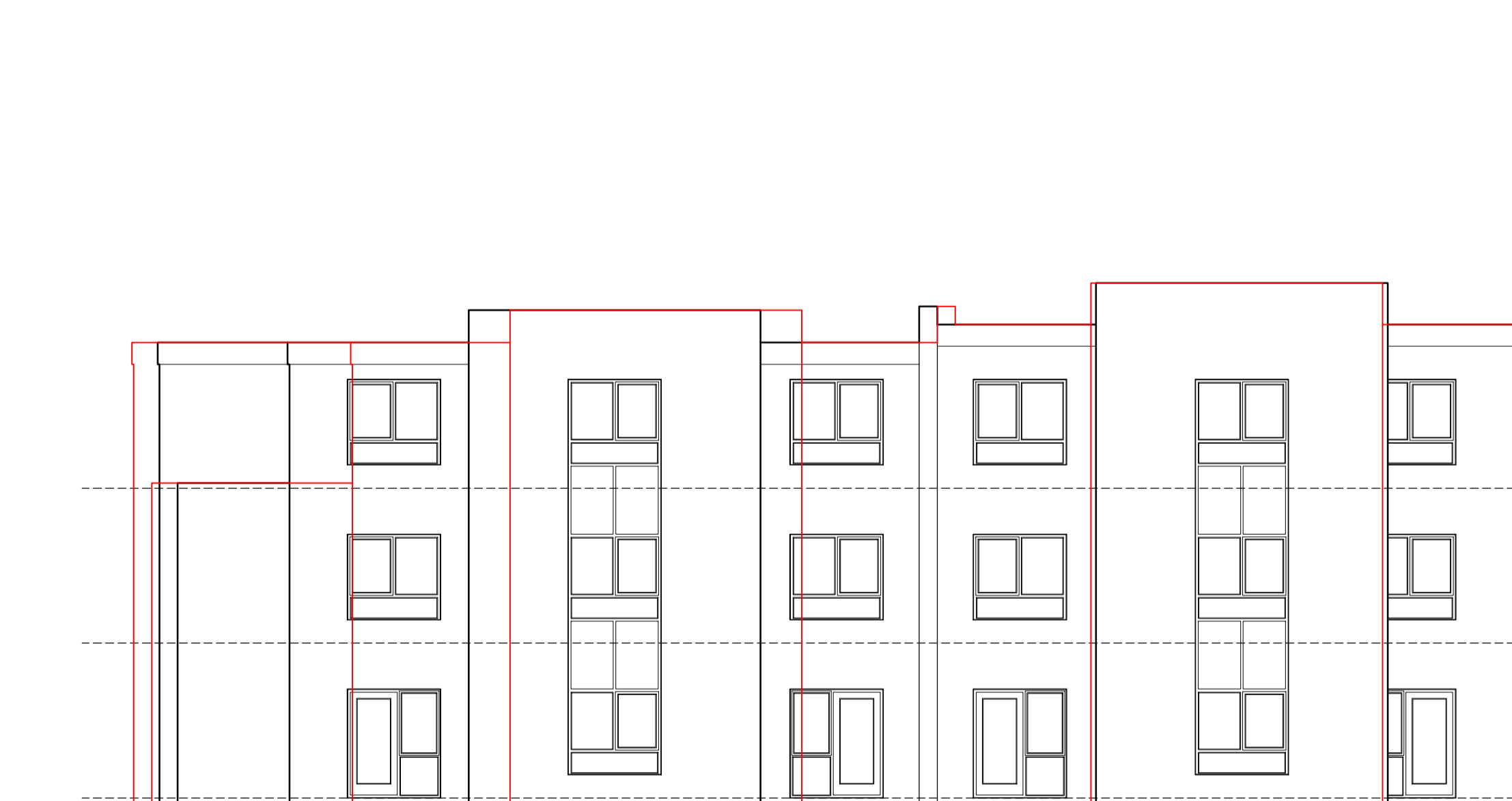
Proposed Elevation C