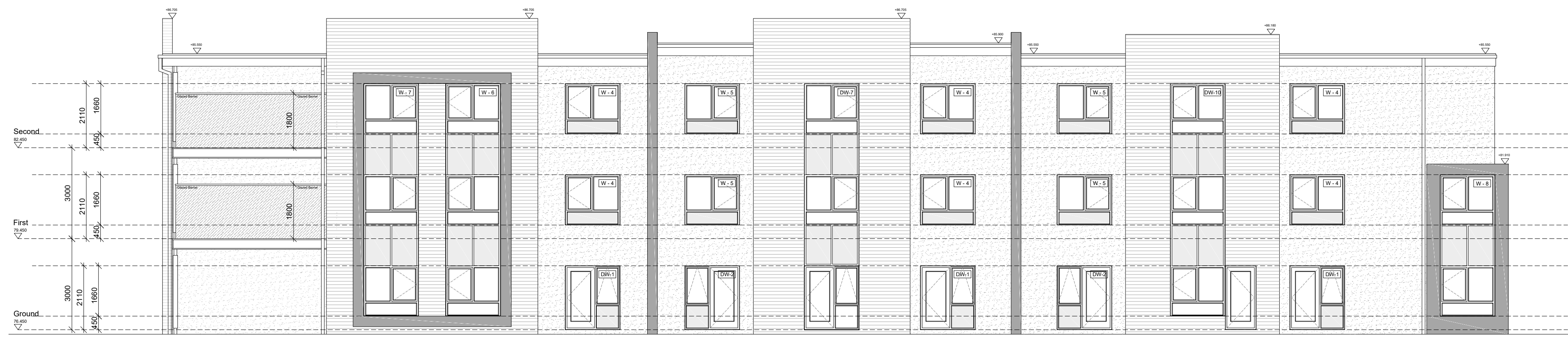
Proposed Elevation A