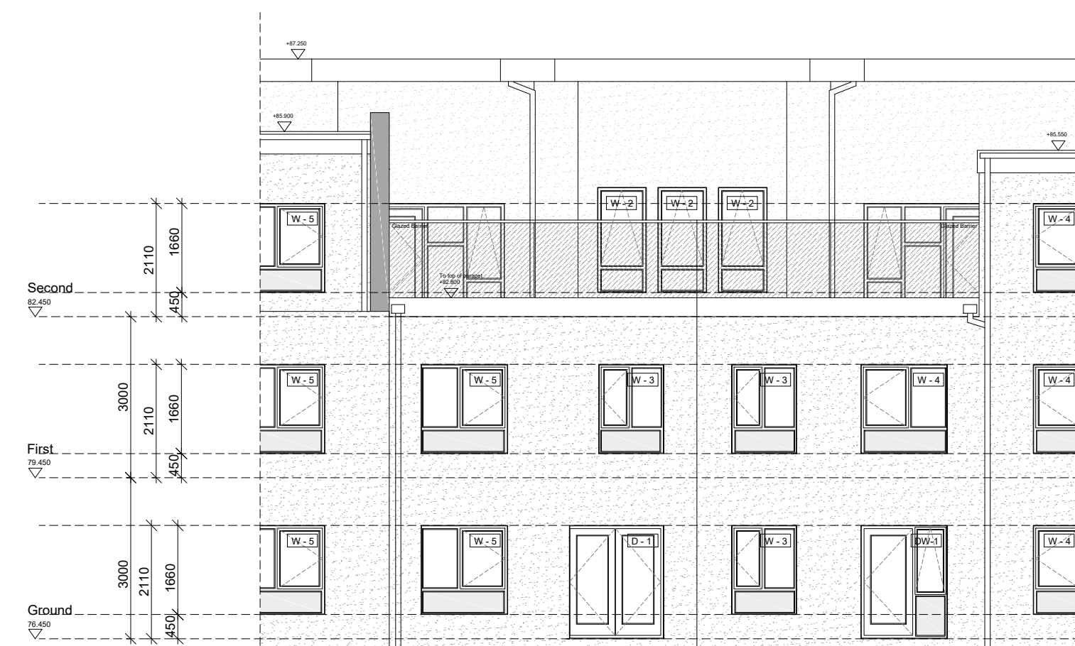
Proposed Elevation D