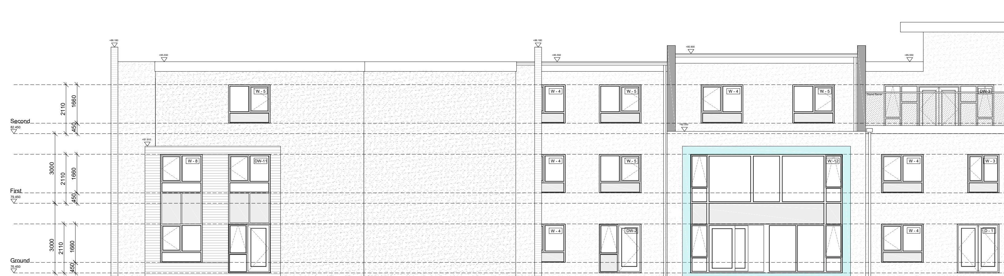
Proposed Elevation B