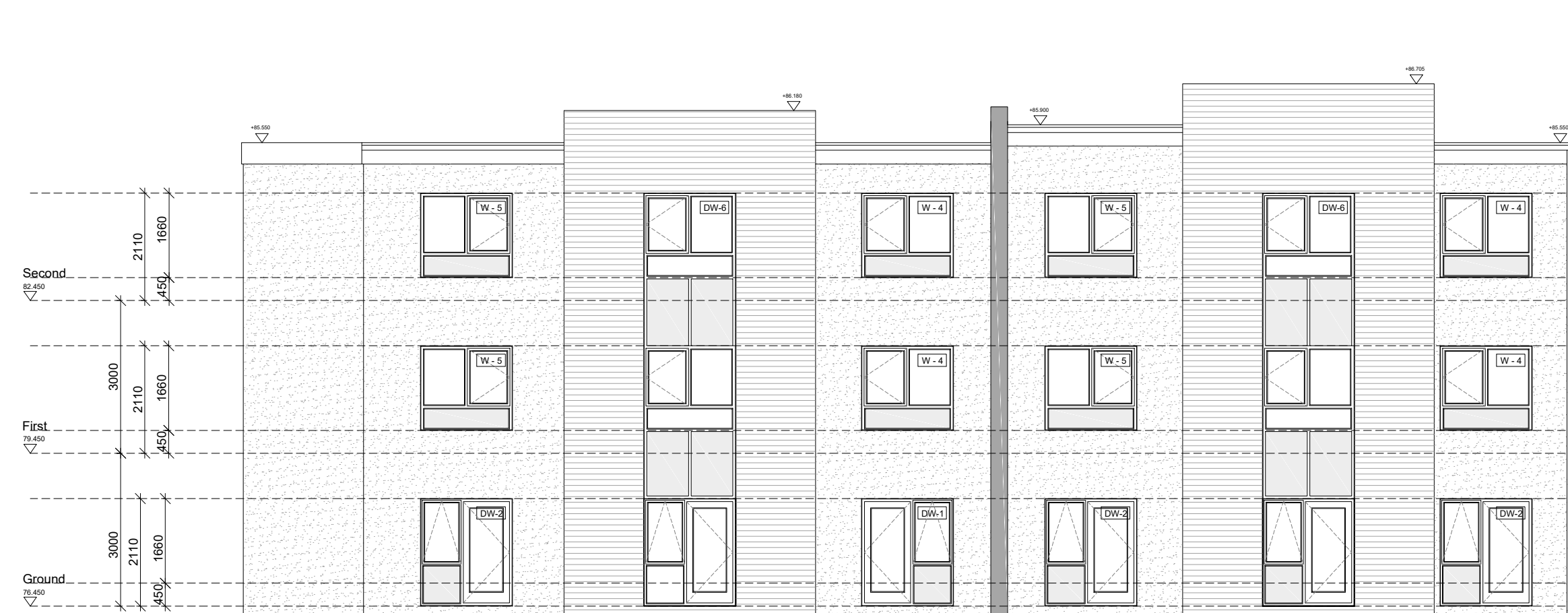
Proposed Elevation C