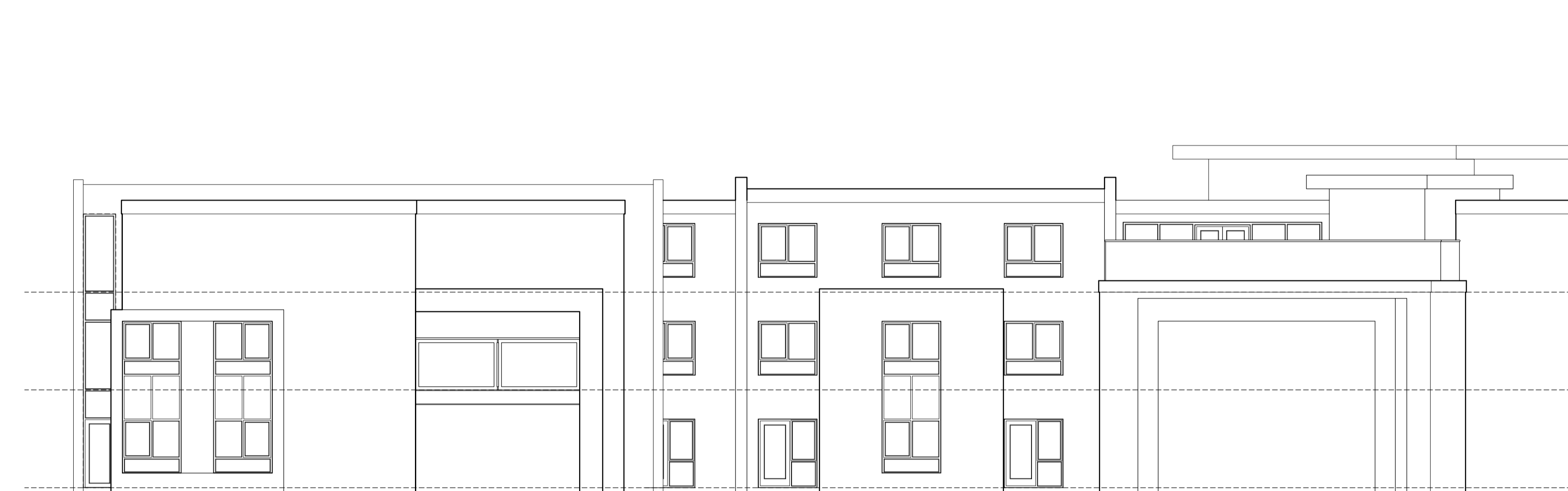
Proposed Elevation B