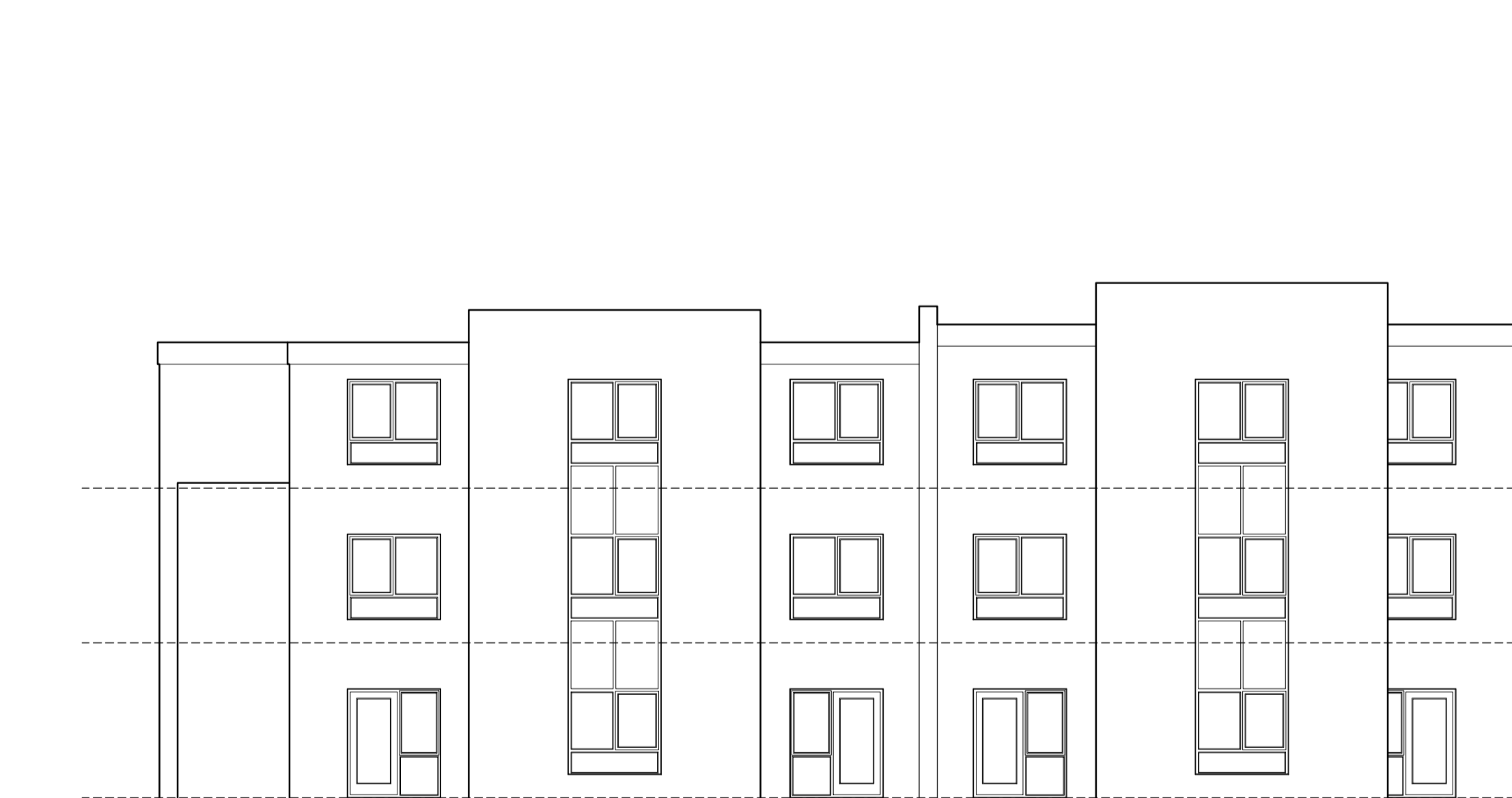
Proposed Elevation C