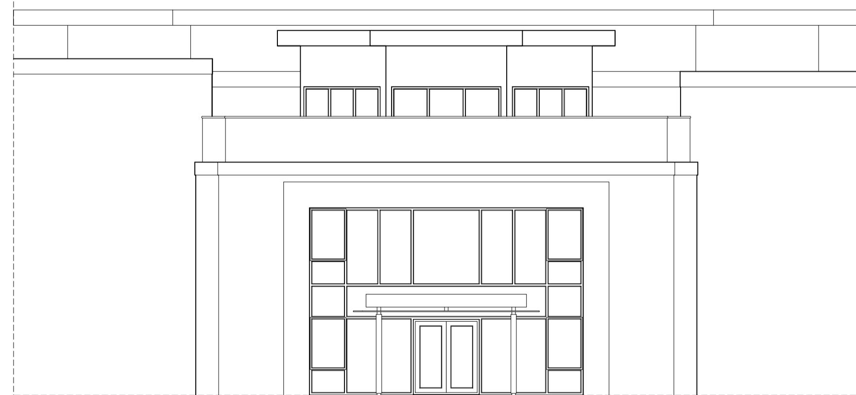
Proposed Elevation D