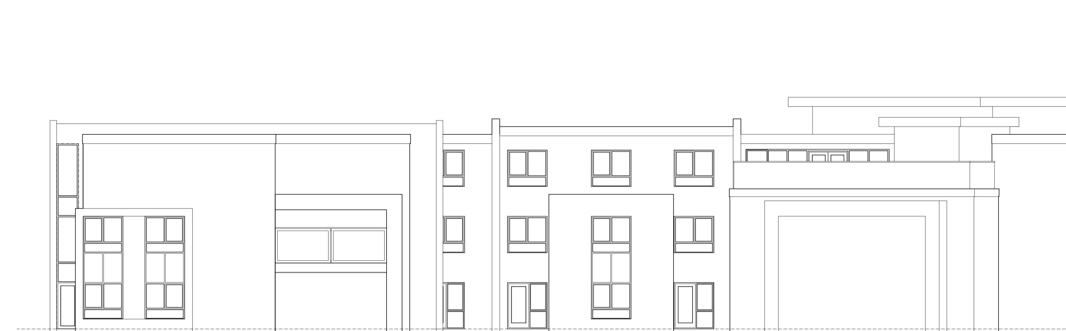
Proposed Elevation B