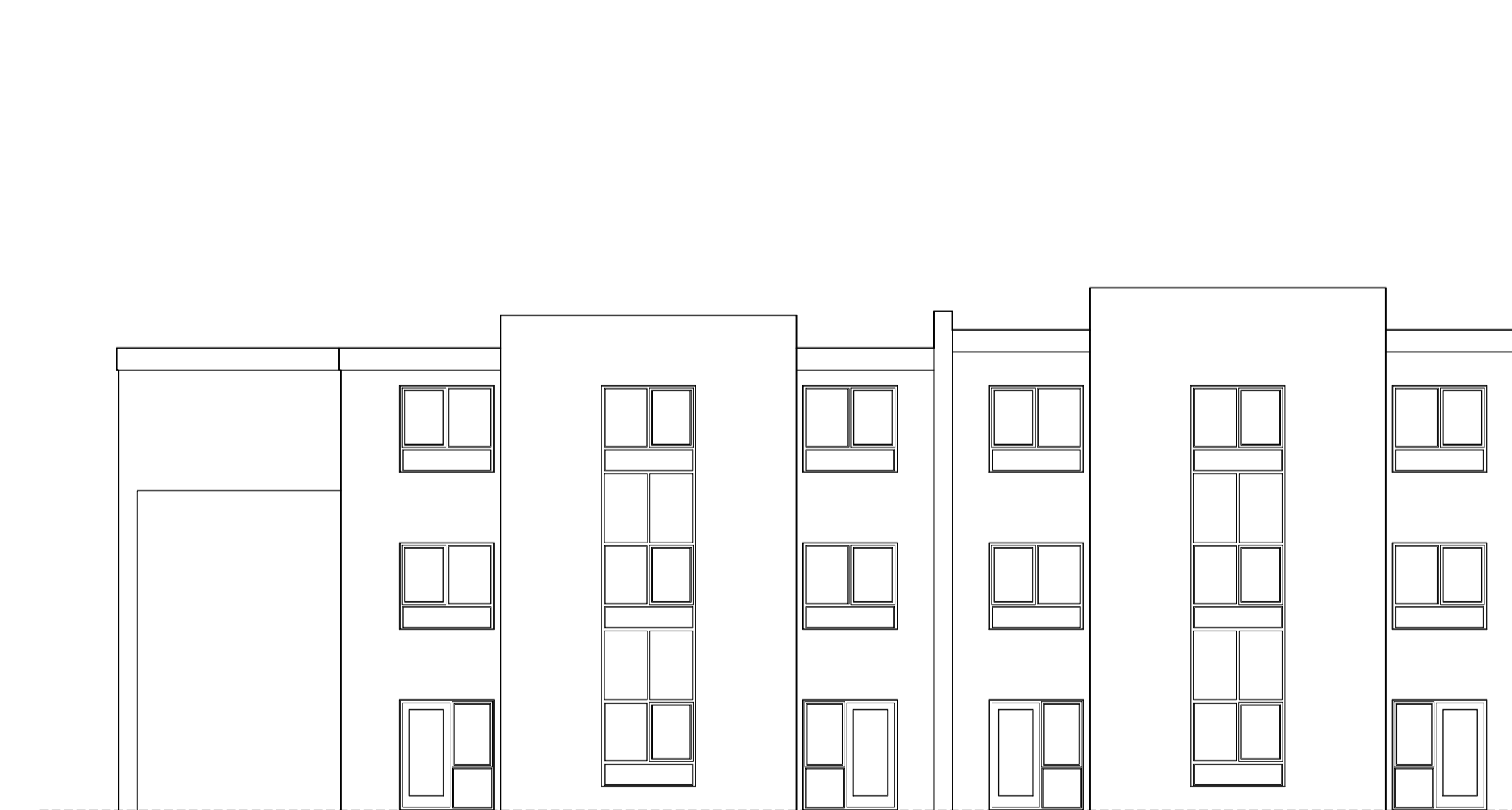
Proposed Elevation C