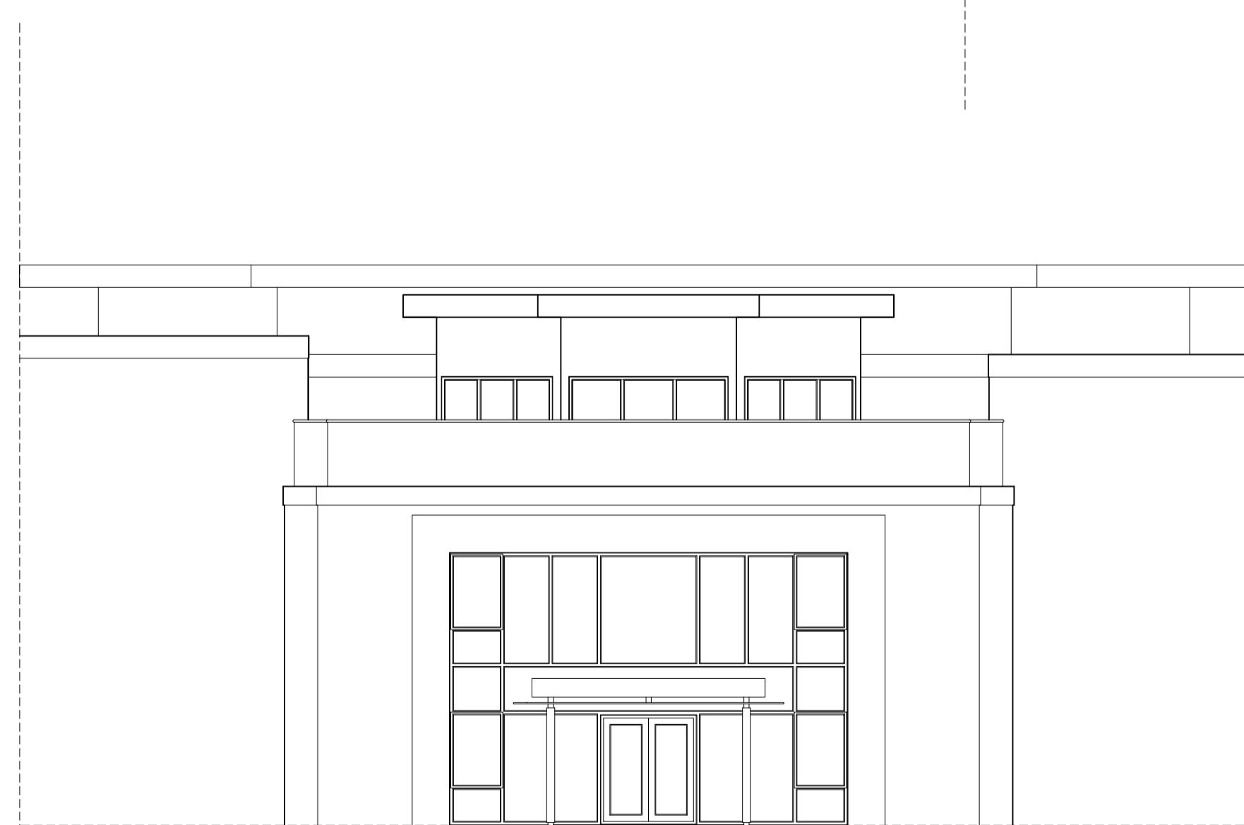
Proposed Elevation D