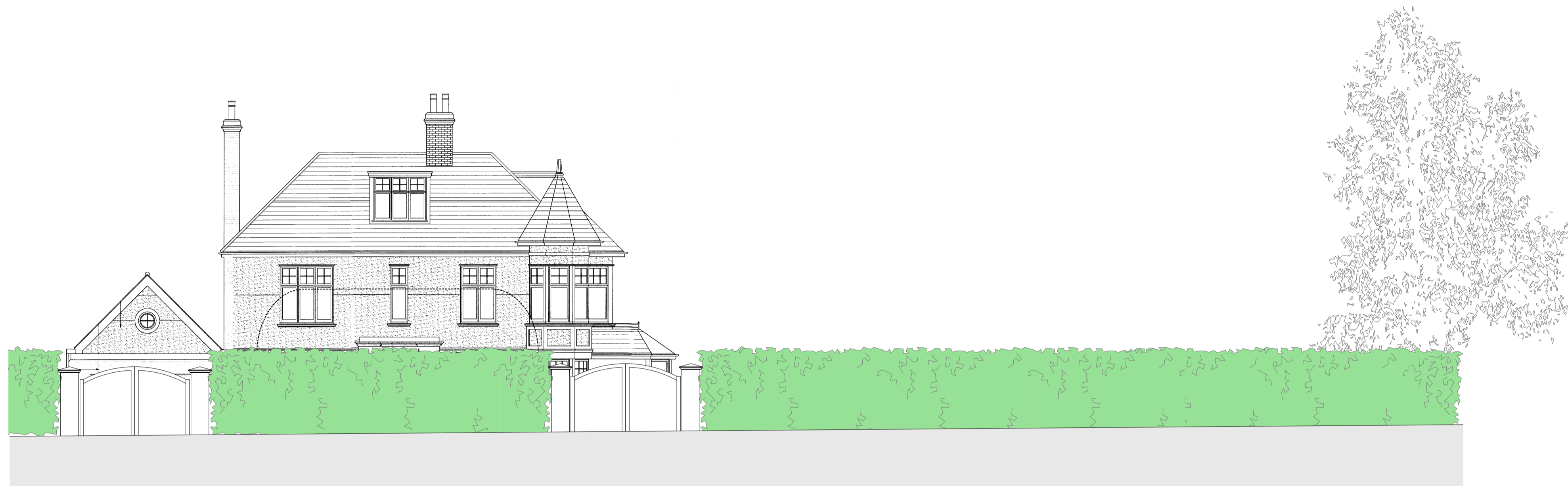
EXISTING STREET ELEVATION 1:100