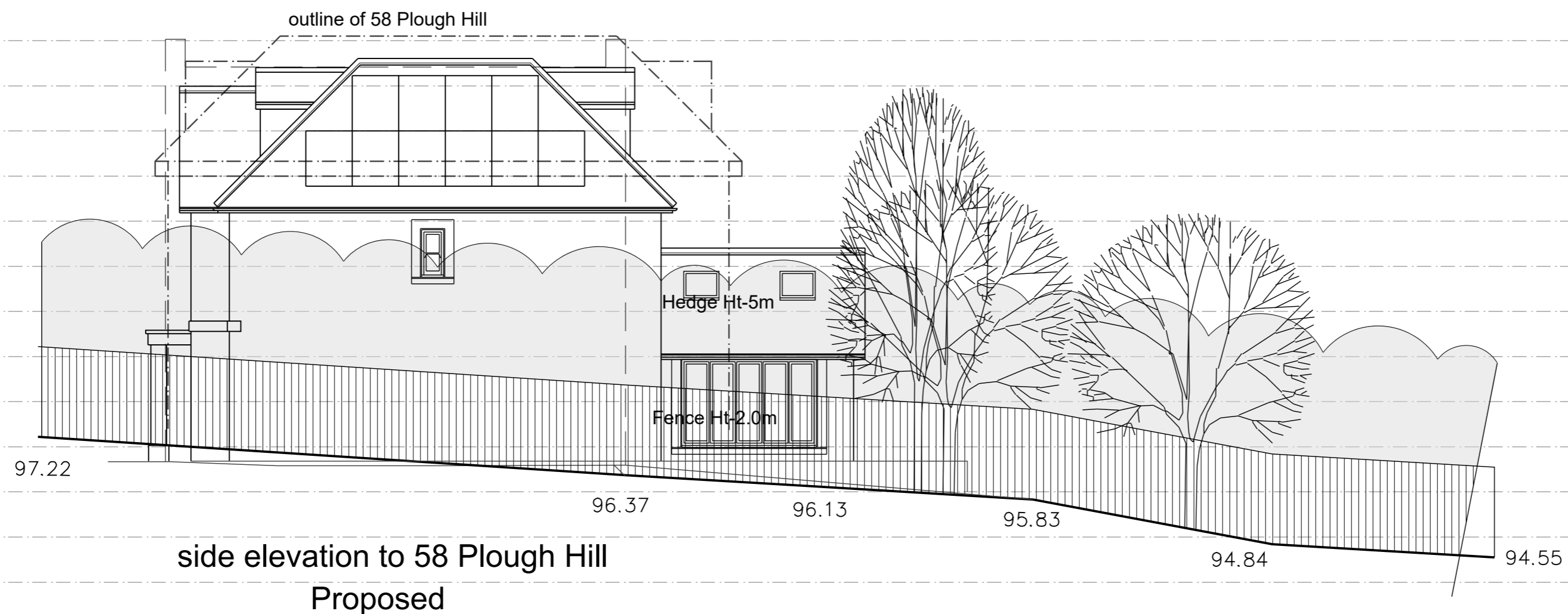
side elevation to 58 Plough Hill Proposed

107m 106m 105m 104m 103m 102m 101m 100m 99m 98m 97m 96m 95m 94m 93m 92m 91m 90m Datum