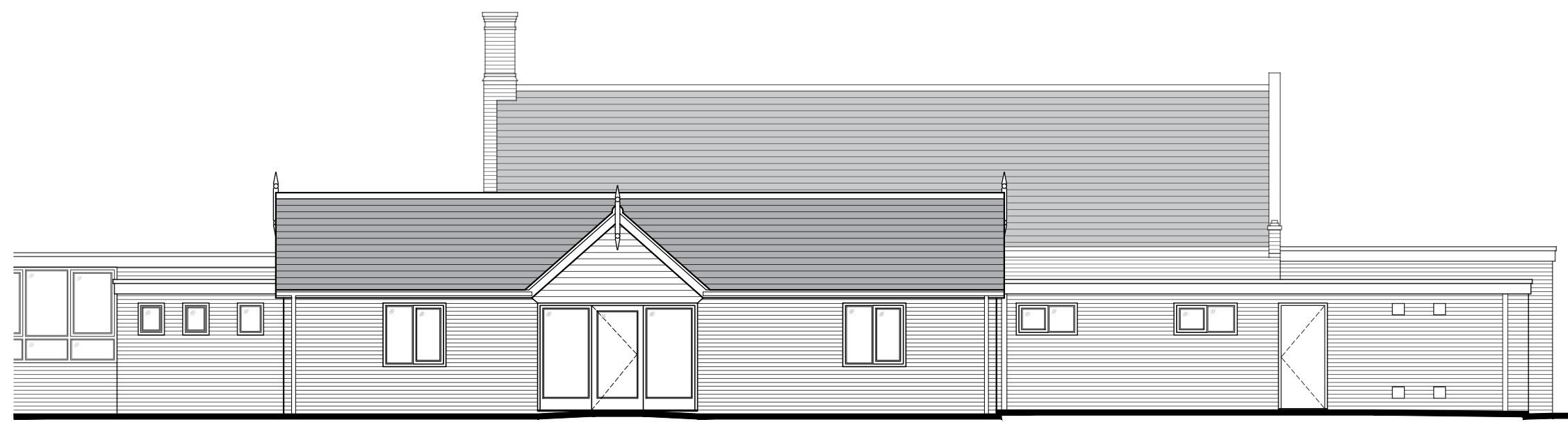
EXISTING FRONT (SOUTH) ELEVATION

All dimensions to be verified on site by Main Contractor before the start of any shop drawings or work whatsoever either on their own behalf or that of sub-contractors. Report any discrepancies to the Contract Administrator at once. This drawing is to be read with all relevant Architect's and Engineer's drawings and other relevant information. C. Archer Building Consultancy Ltd.