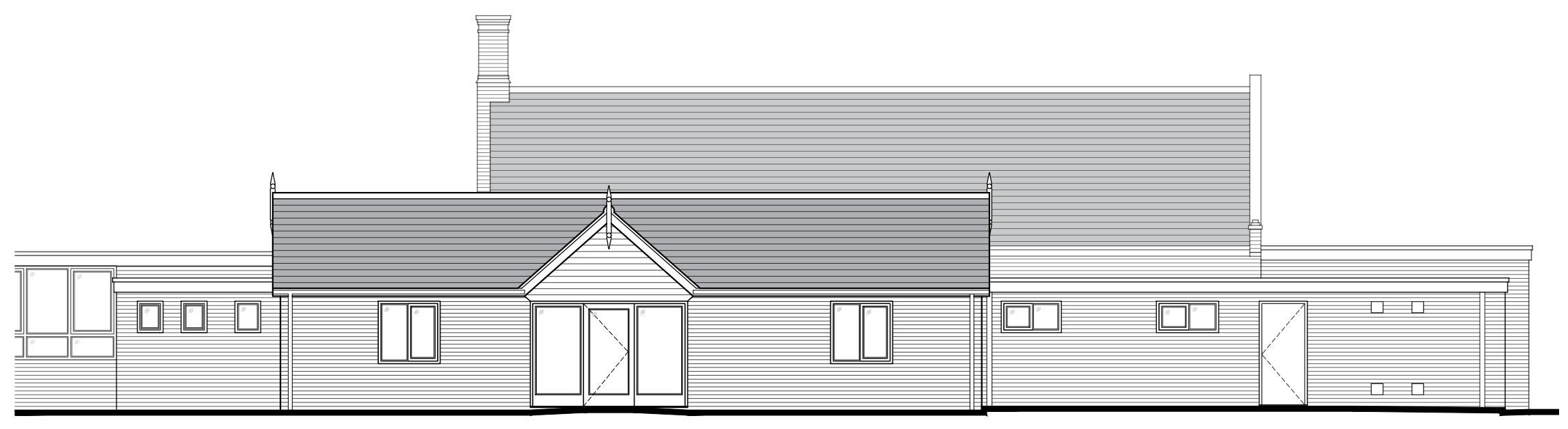
EXISTING FRONT (SOUTH) ELEVATION