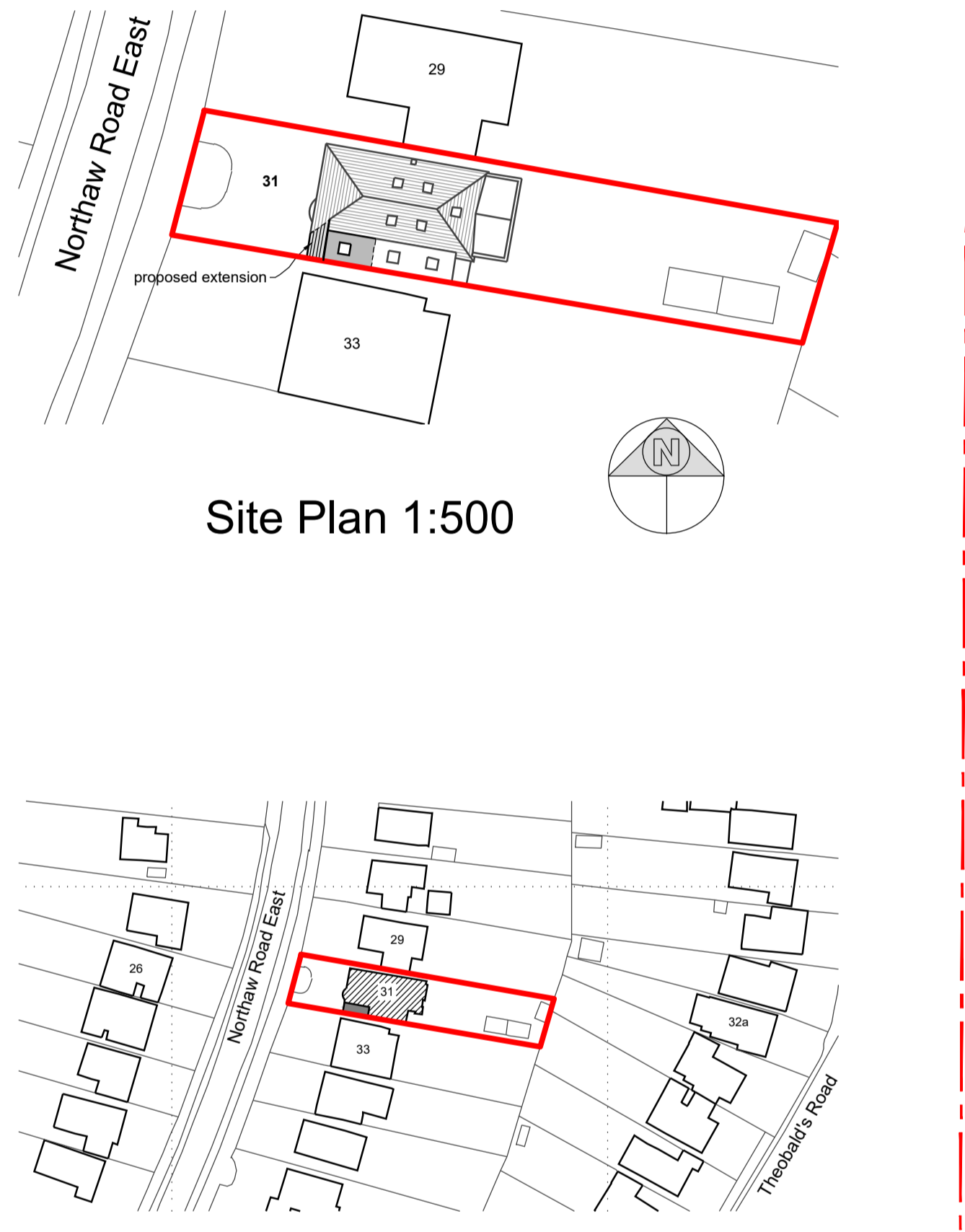
Site Plan 1:500