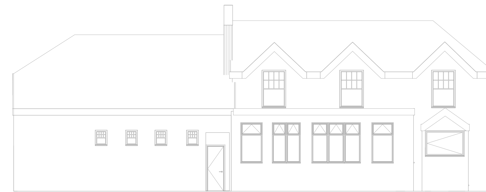
FRONT ELEVATION SCALE: 1 : 100