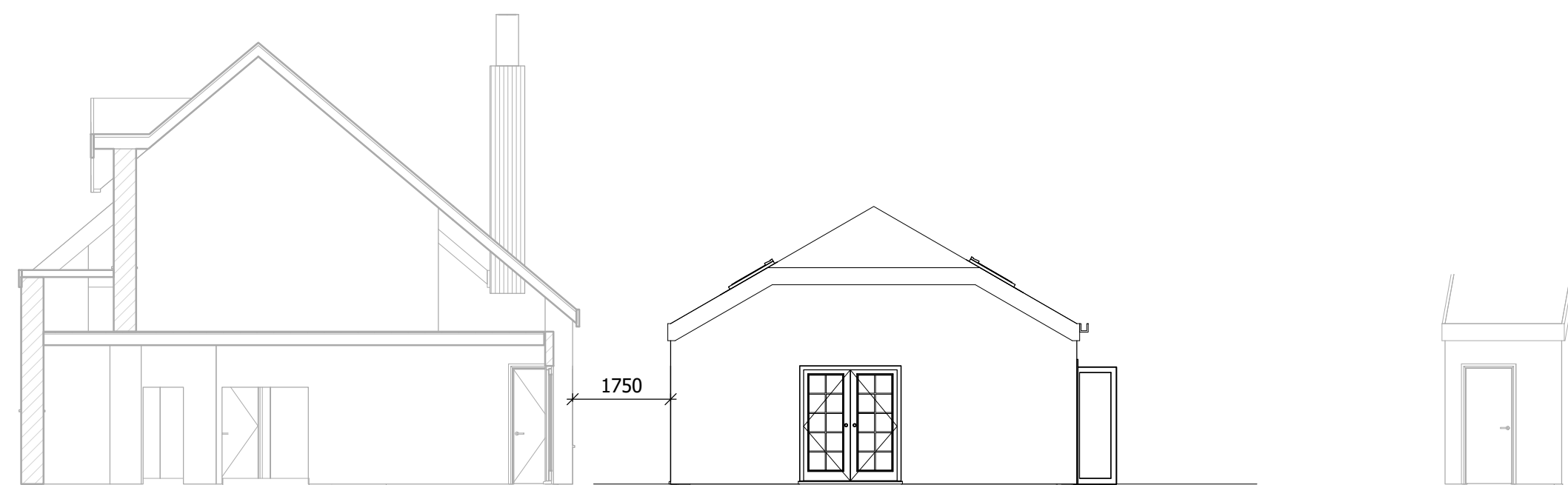
SIDE ELEVATION 3 SCALE: 1 : 100