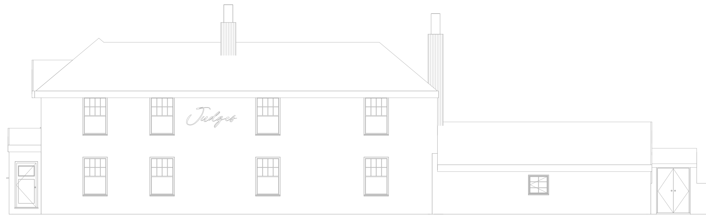
SIDE ELEVATION 2 SCALE: 1 : 100