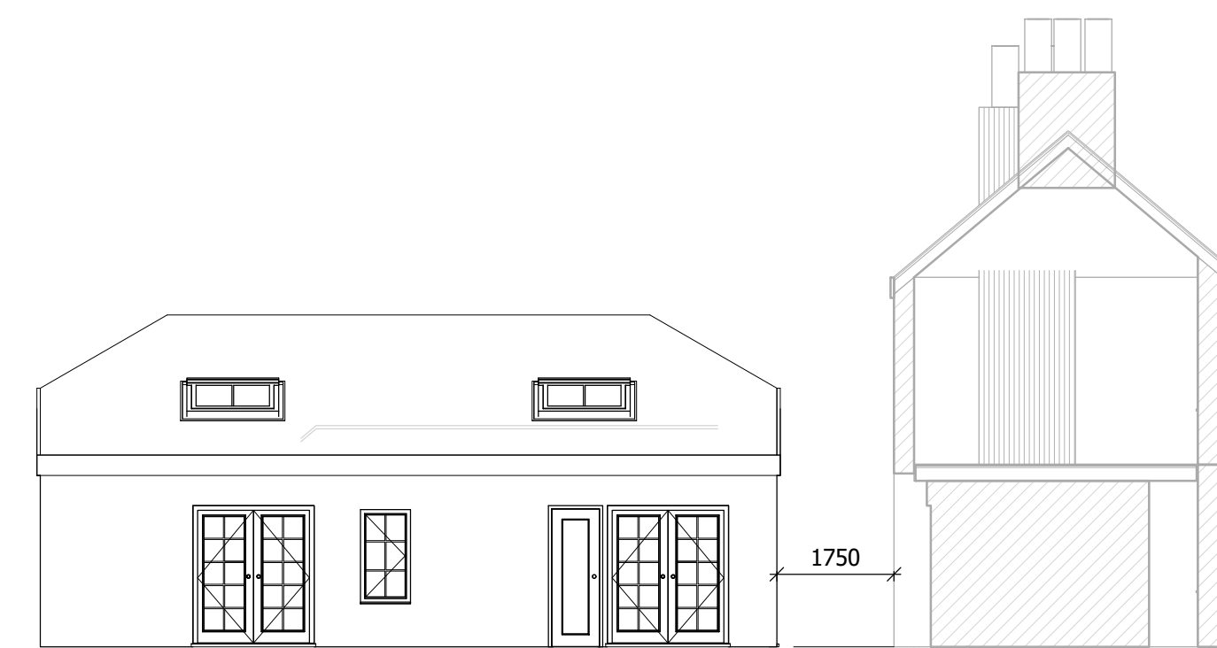
FRONT ELEVATION SCALE: 1 : 100