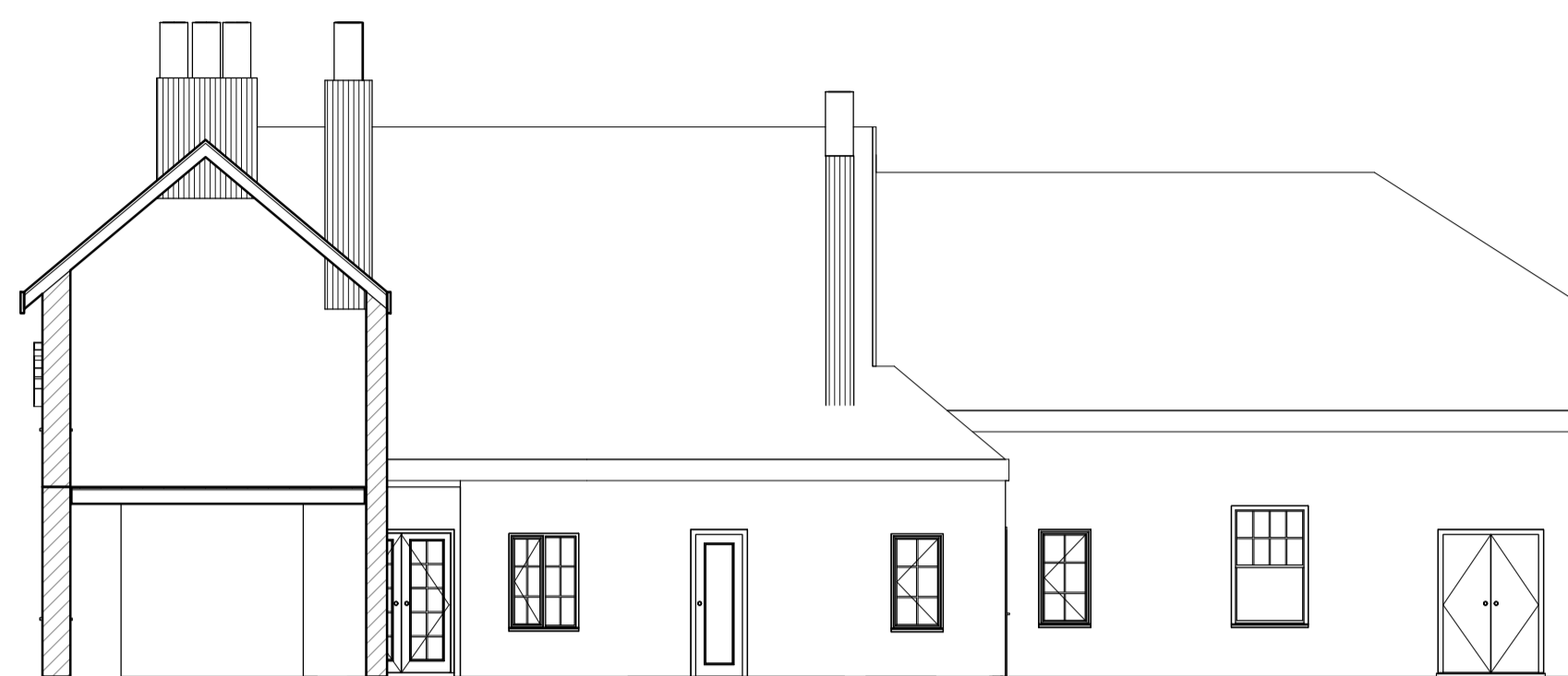
REAR ELEVATION SCALE: 1 : 100