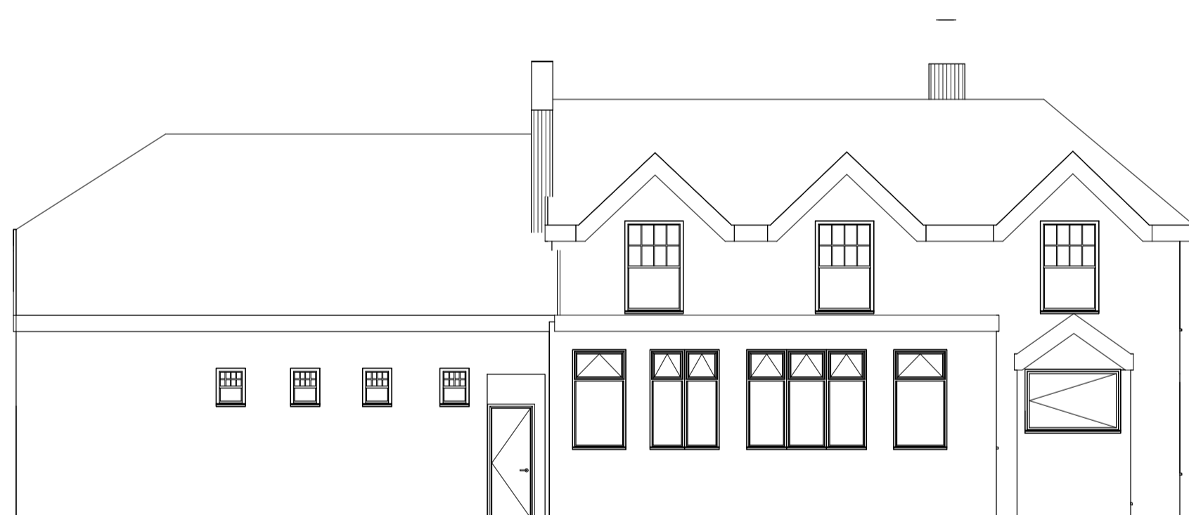
FRONT ELEVATION SCALE: 1 : 100