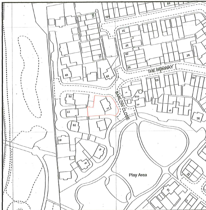
Figure 1: Site Location Plan