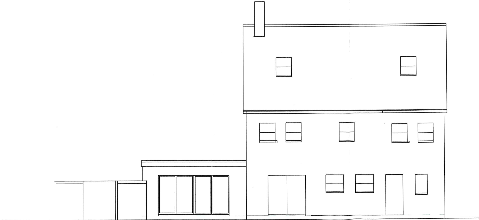
Front Elevation As built