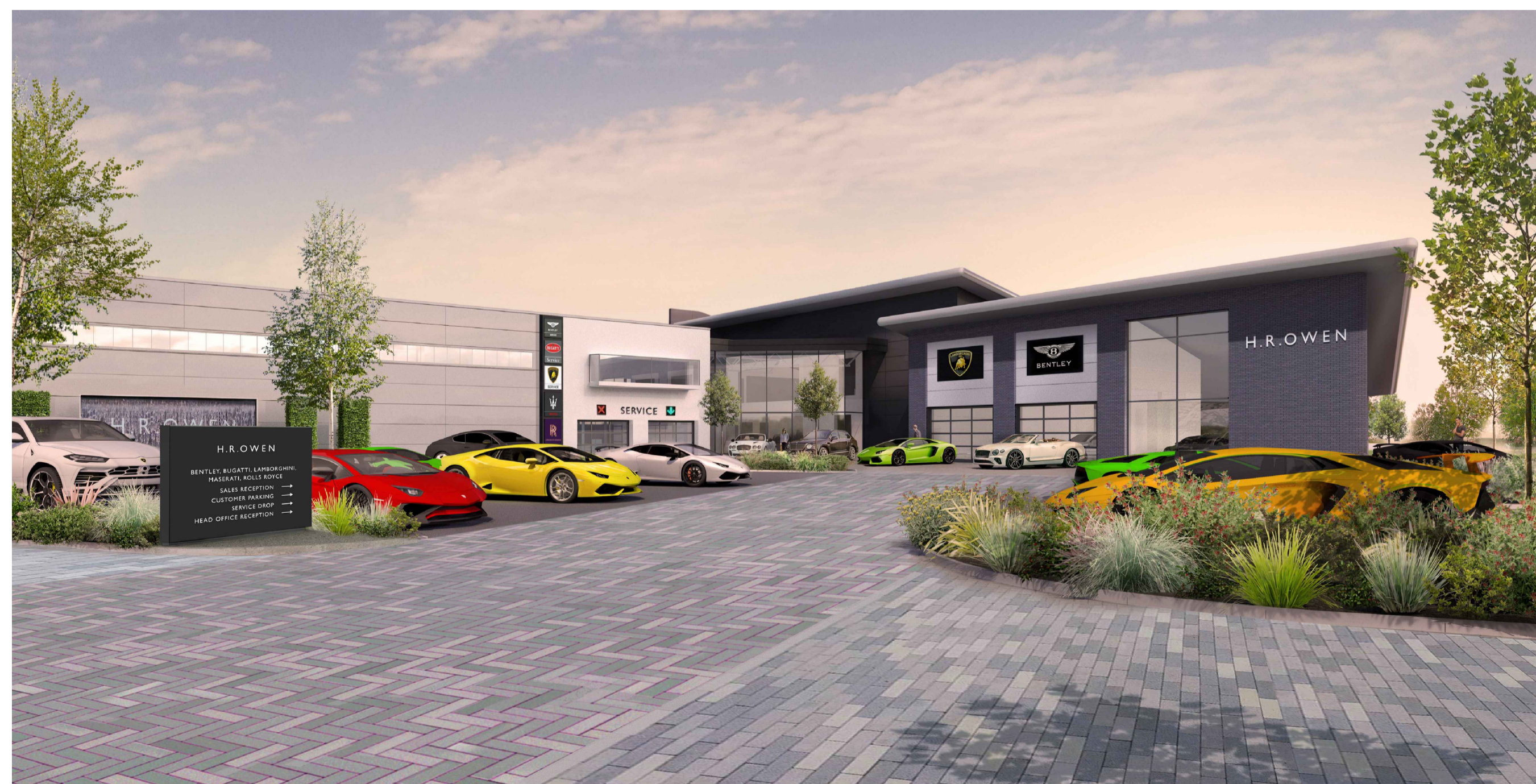
Indicative View of East Building