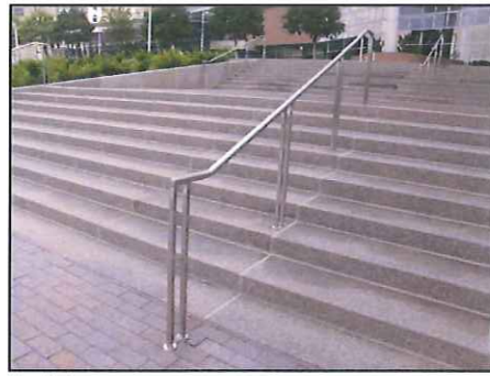
Handrails: Handrail Direct Components 1000mm high or similar approved

( https://www.primrose.co.uk/p-55740.html ?adtype=pla&kwid=&gclid=C0wv16W0yQC Famw7QodEw0ISQ)