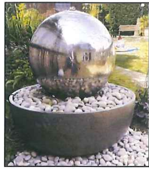
Entrance water feature: Primrose 50cm Giant Eclipse Stainless Steel Sphere Water Feature or similar approved

( https://www.primrose.co.uk/p-55740.html ?adtype=pla&kwid=&gclid=C0wv16W0yQC Famw7QodEw0ISQ)