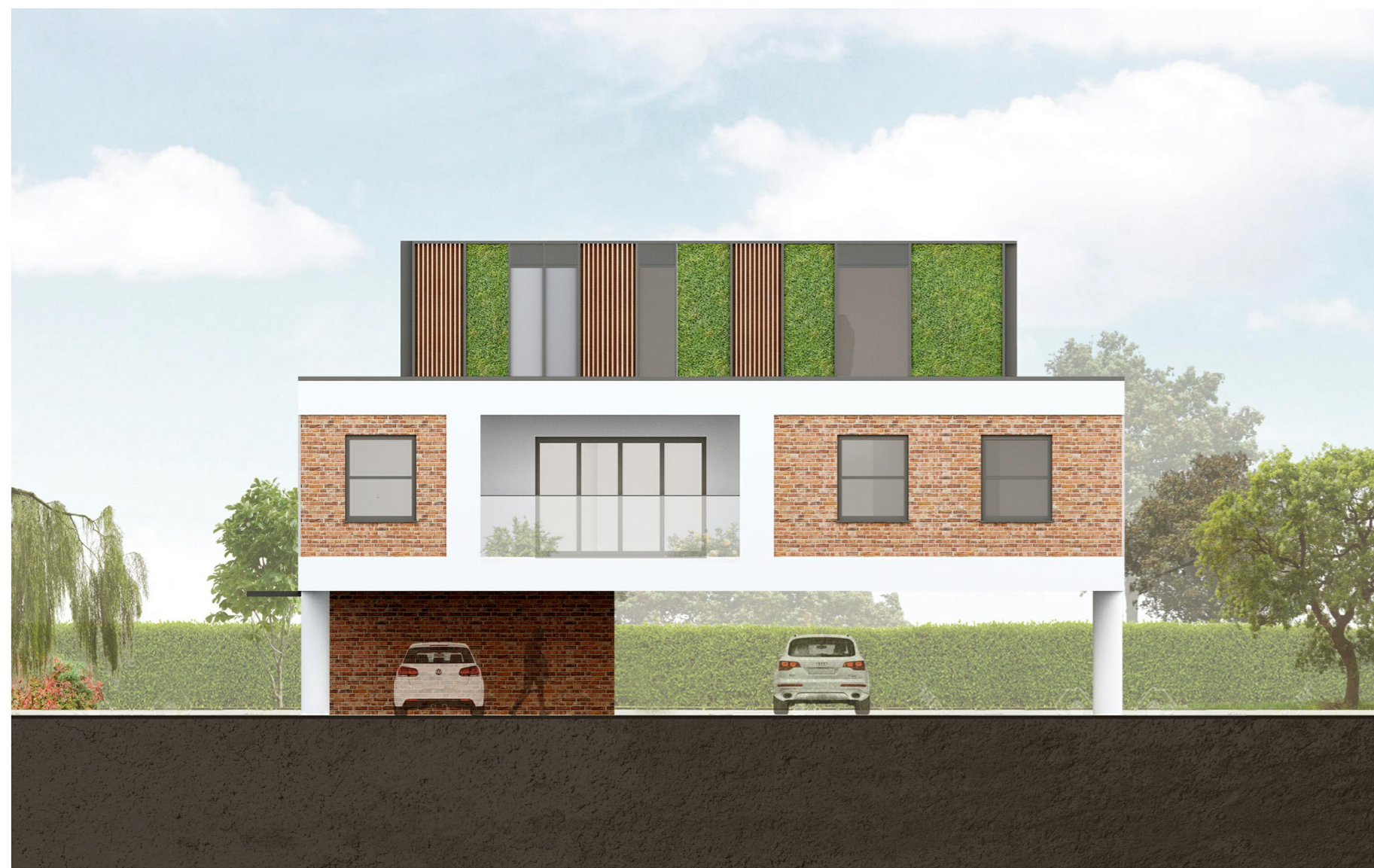
2 Proposed West Elevation 1:100