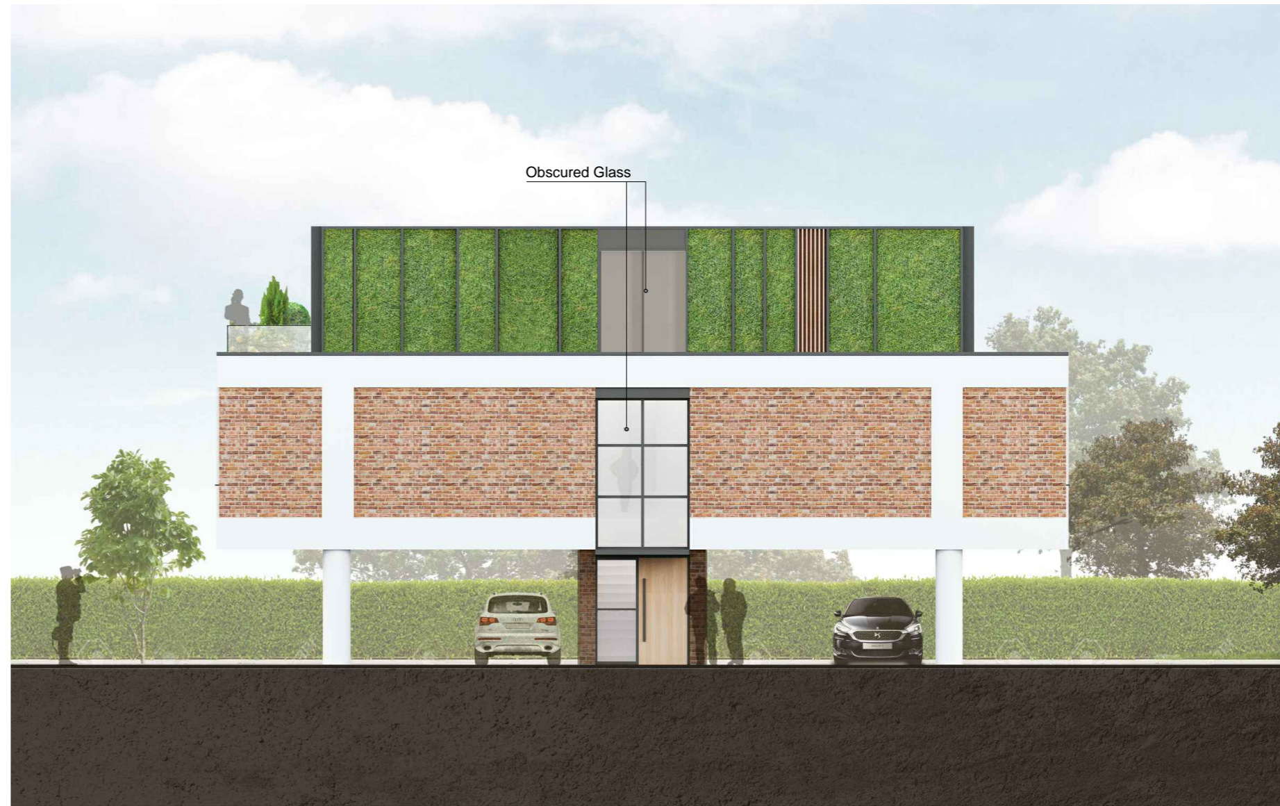
3 Proposed North Elevation 1:100