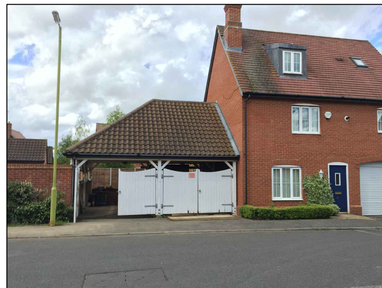
GARAGES OF NO. 2