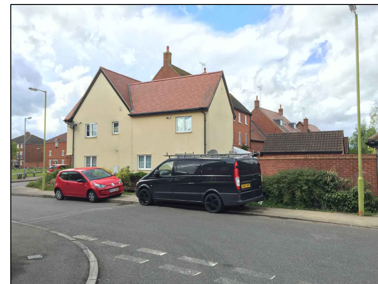
SIDE VIEW OF NO. 2