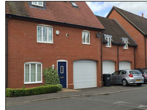
VIEW OF NO.2 SALISBURY HALL DRIVE