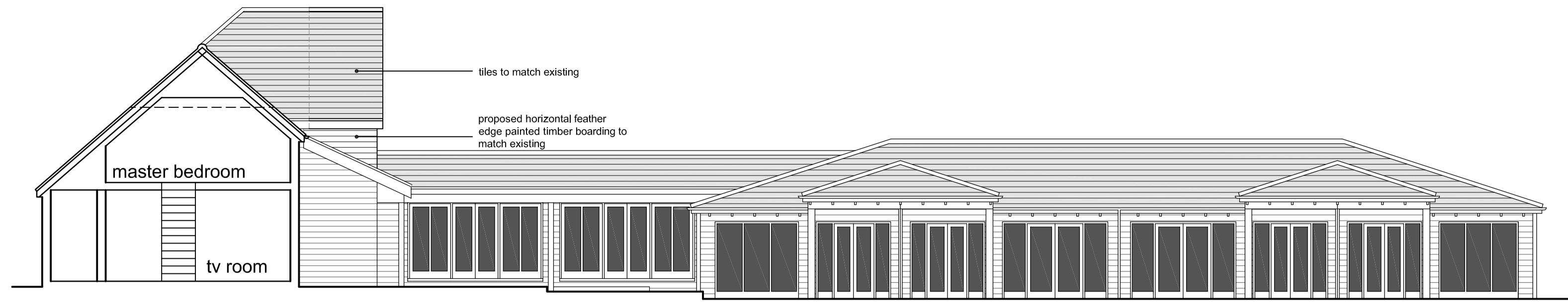
Elevation B / Section