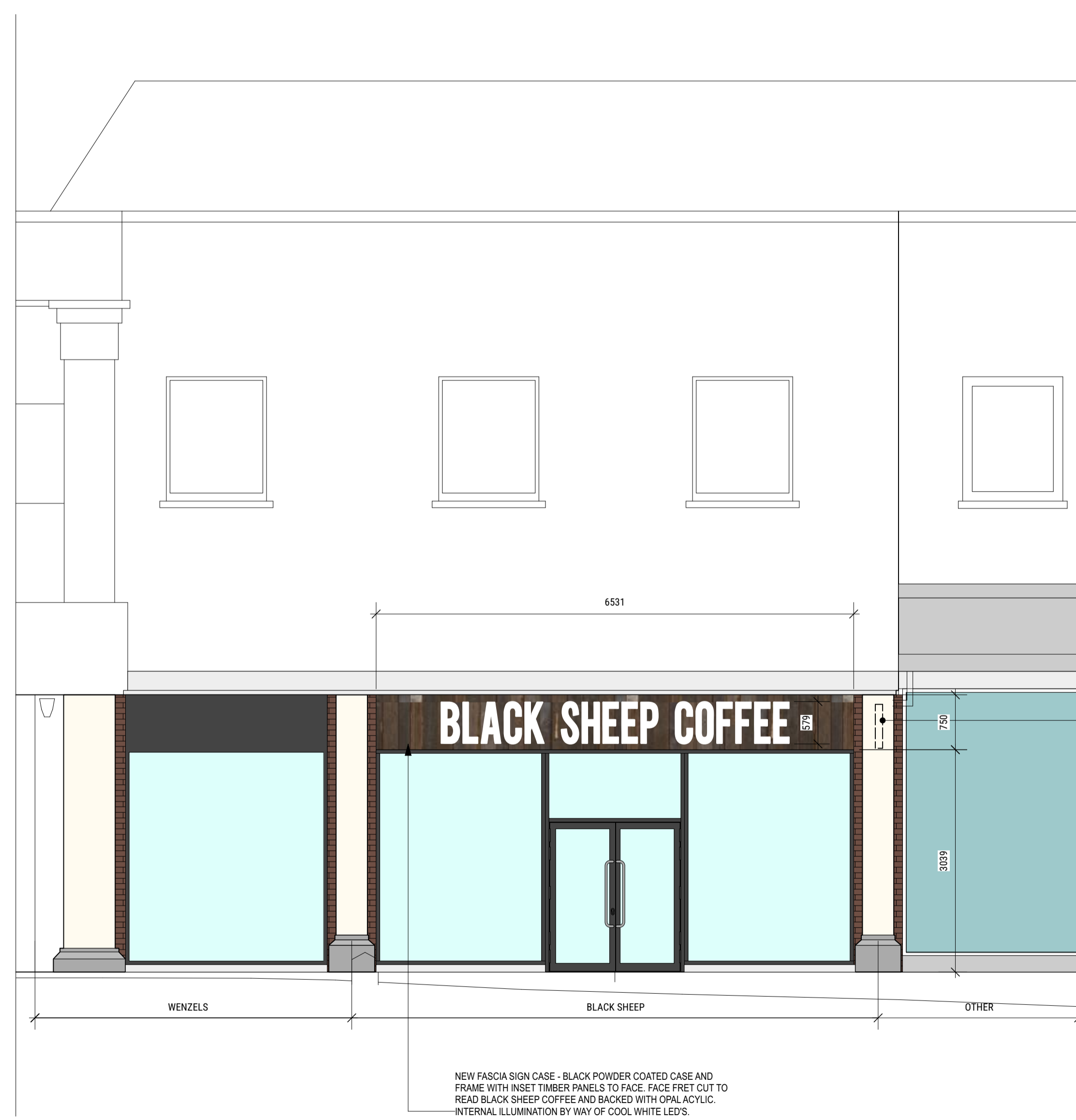
2 ELEVATION BB - EXTERIOR Scale: 1:50

NEW FASCIA SIGN CASE - BLACK POWDER COATED CASE AND FRAME WITH INSET TIMBER PANELS TO FACE. FACE FRET CUT TO READ BLACK SHEEP COFFEE AND BACKED WITH OPAL ACRYLIC. INTERNAL ILLUMINATION BY WAY OF COOL WHITE LEDS.