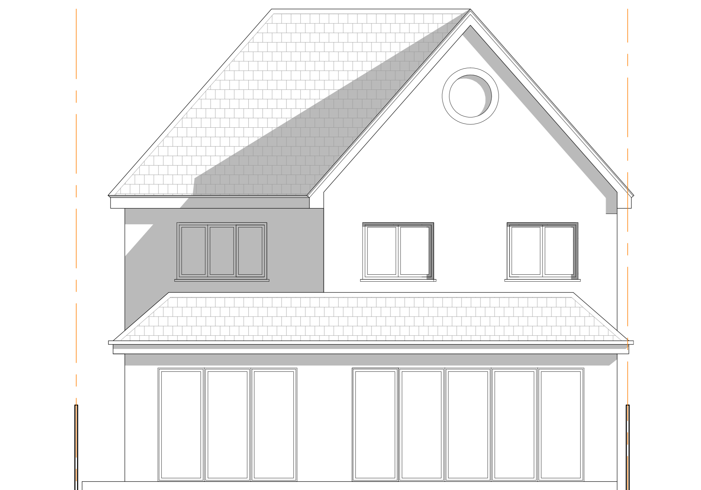
PROPOSED SOUTH WEST ELEVATION (UNAFECTED) 1:50