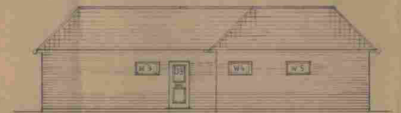
SIDE ELEVATION FACING NORTH EAST