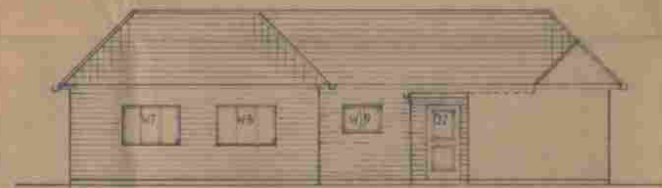
SIDE ELEVATION FACING SOUTH WEST