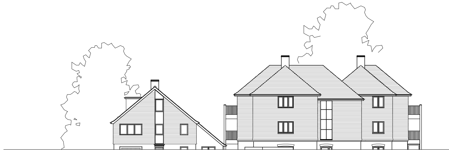
VIEW FROM GREAT NORTH ROAD (NORTH ELEVATION)