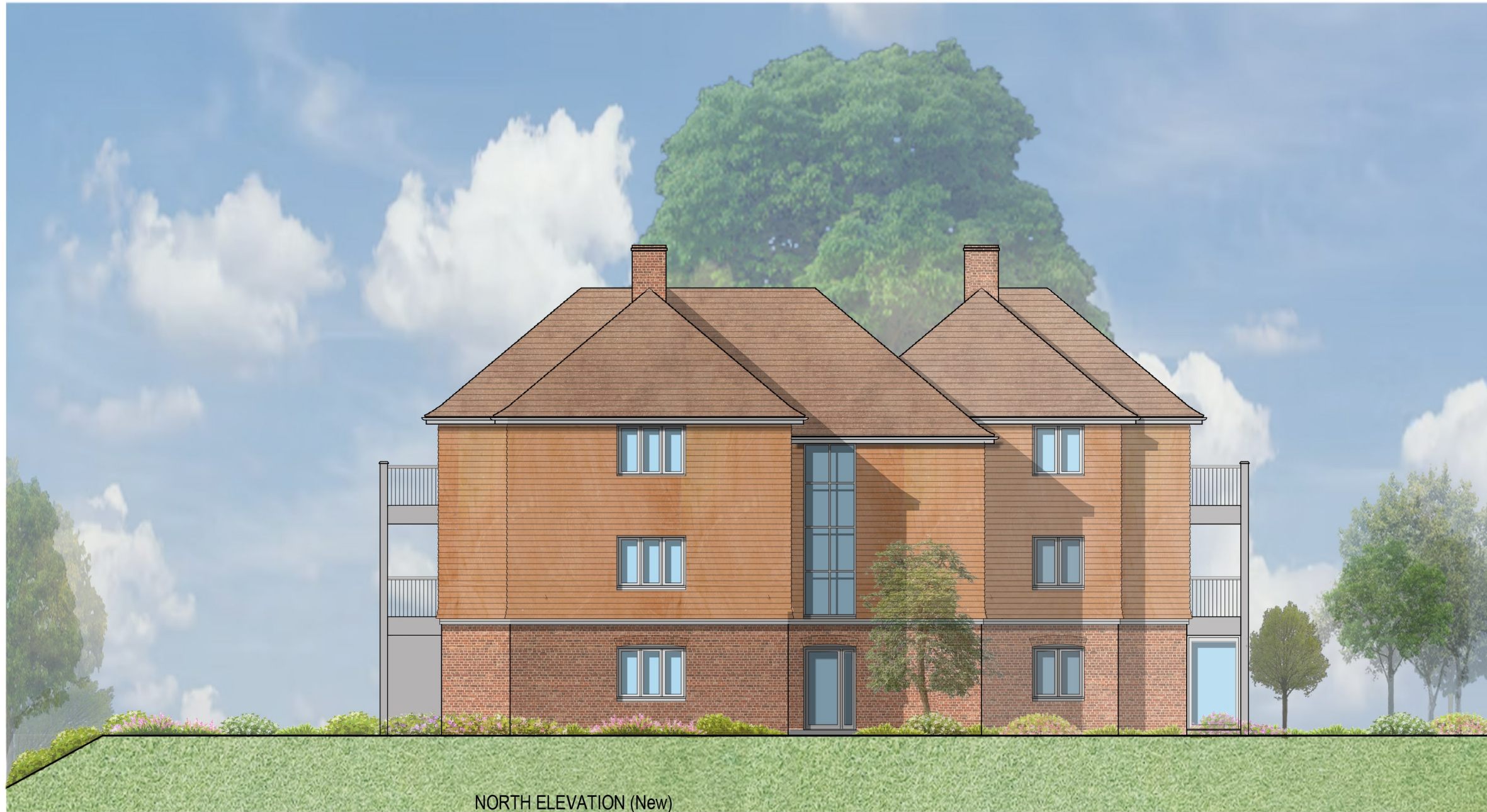
NORTH ELEVATION (New)