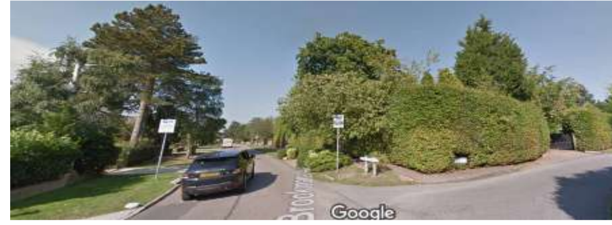
Figure 1: View towards the Brookmans Avenue site boundary

The plot is situated on the corner of Brookmans Avenue and Golf Club Road. It currently consists of a large property and outbuildings set within gardens. The site is screened by a tall beech hedge along Brookmans Avenue and part along Golf Club Road (refer to Figure 1), but then changes to a coniferous hedge in the north east corner. The site is situated on the edge of the urban environment, consisting of managed open space to the north and east in the form of Brookmans Park Golf Club and Chancellor's school playing fields. To the south and west is estate housing.