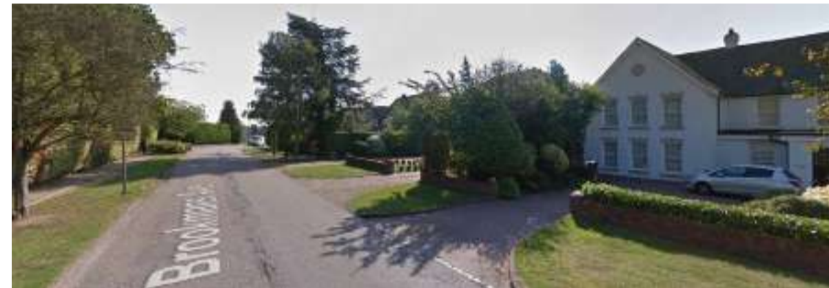
Figure 2: View along Brookmans Avenue facing east towards the site