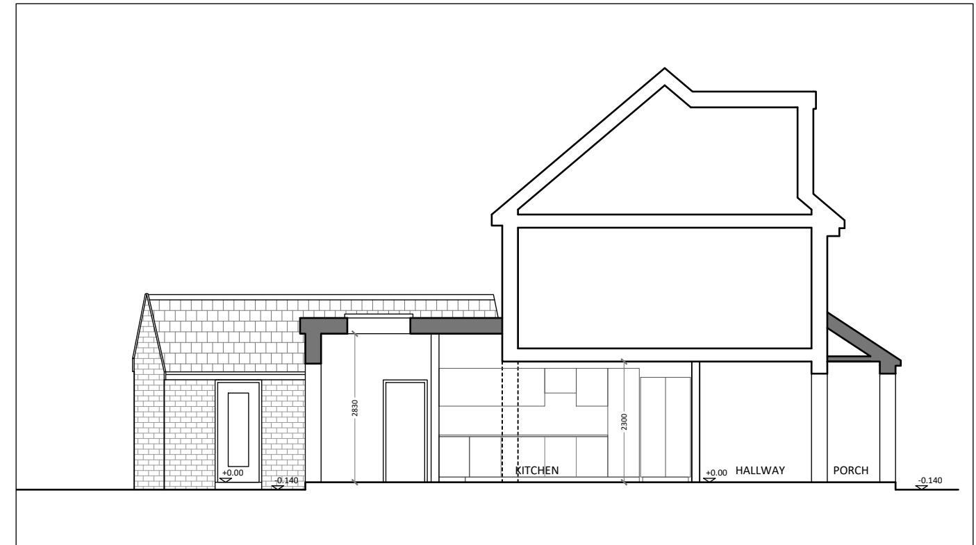
Proposed Section (A-A) Scale 1:100