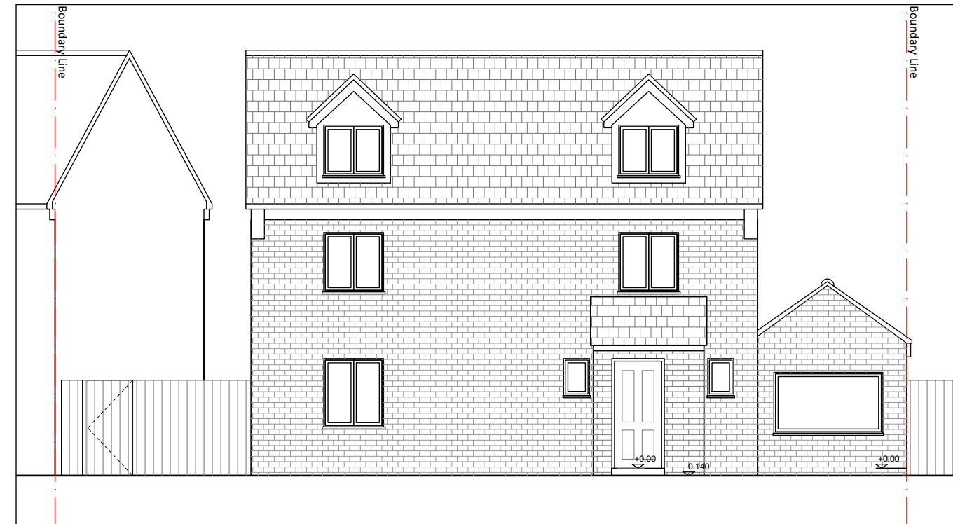
Proposed Front Elevation Scale 1:100