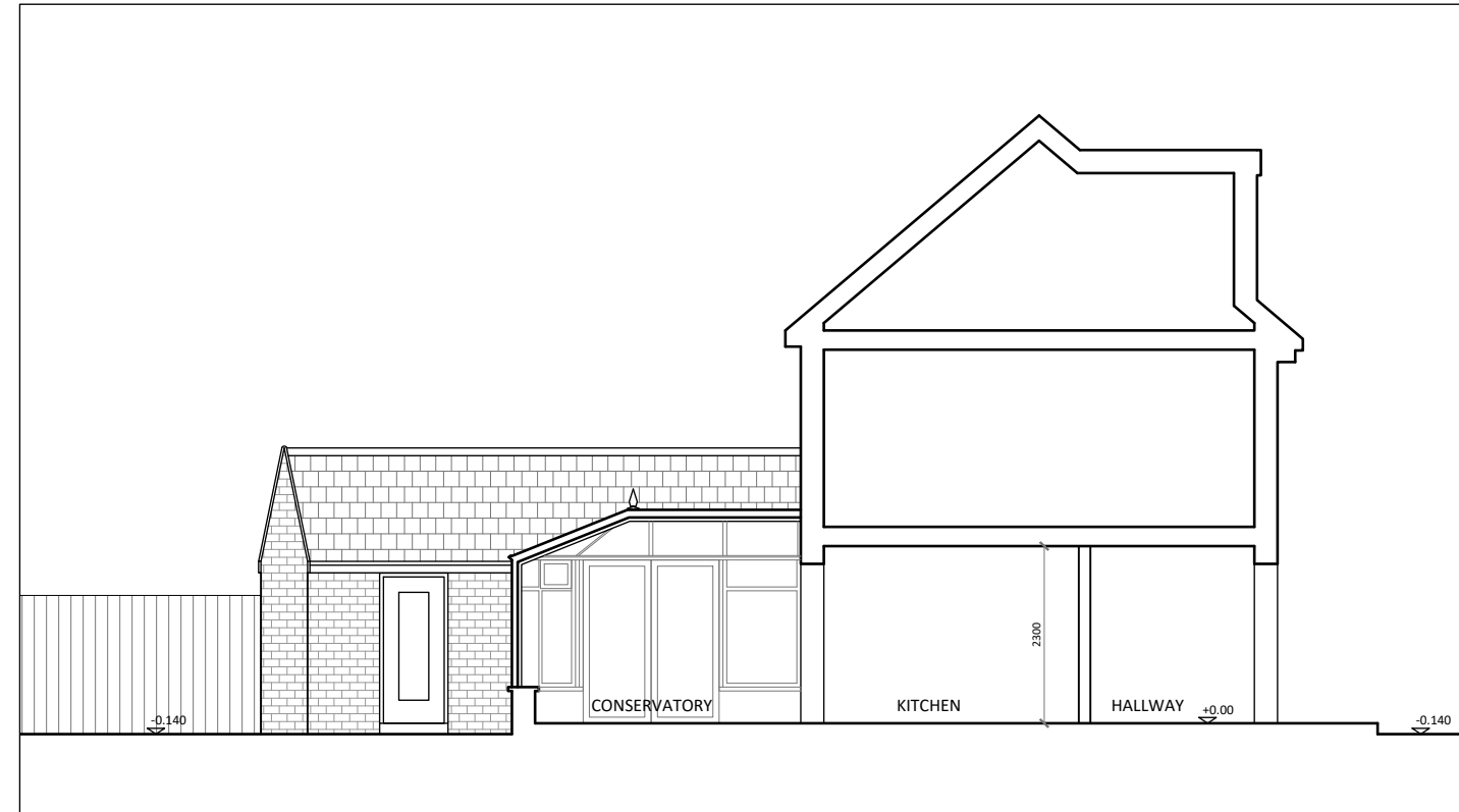
Existing Section (A-A) Scale 1:100