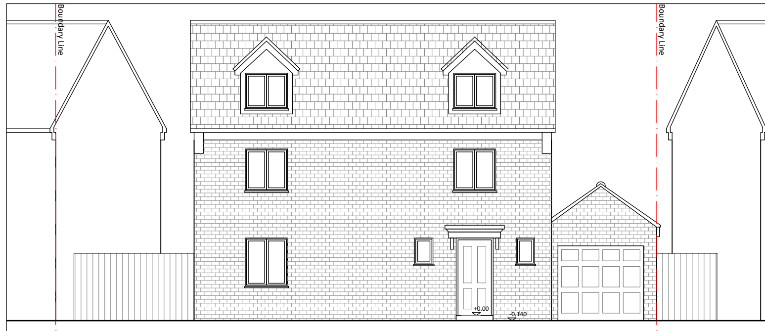
Existing Front Elevation Scale 1:100