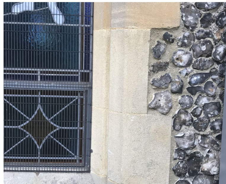
MF7 - Stone Detail and Quoins