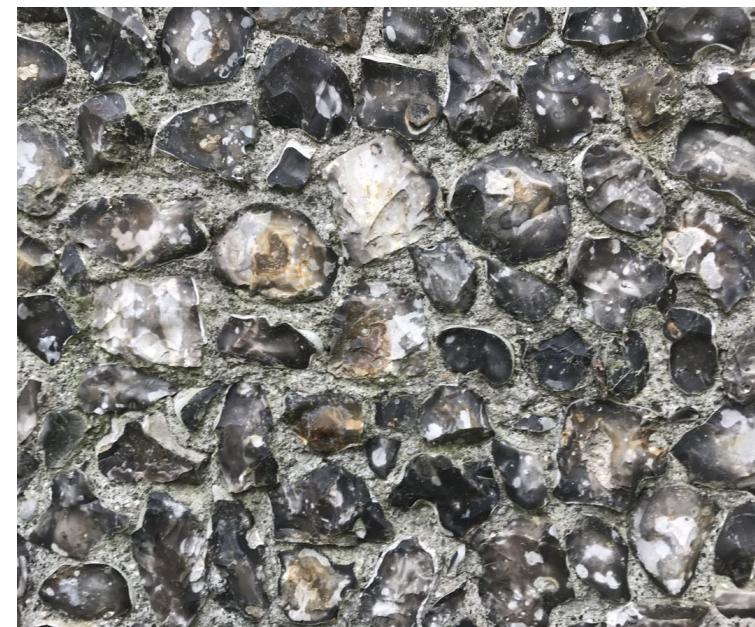
MF8 - Knapped Flint Facing