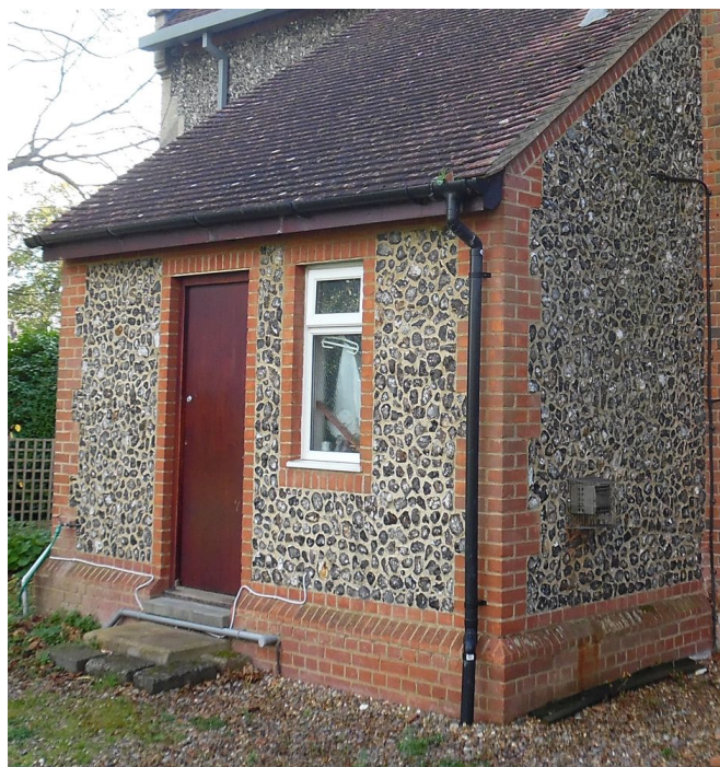
MF9 - Timber Door Type