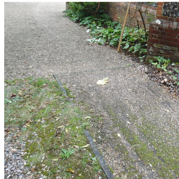
MF11 - Gravel Pathway