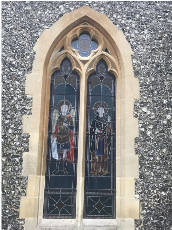
MF6 - Existing Stain Glass Windows To Be Relocated