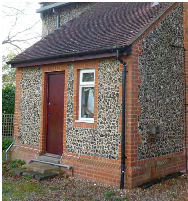
MF9 - Timber Door Type