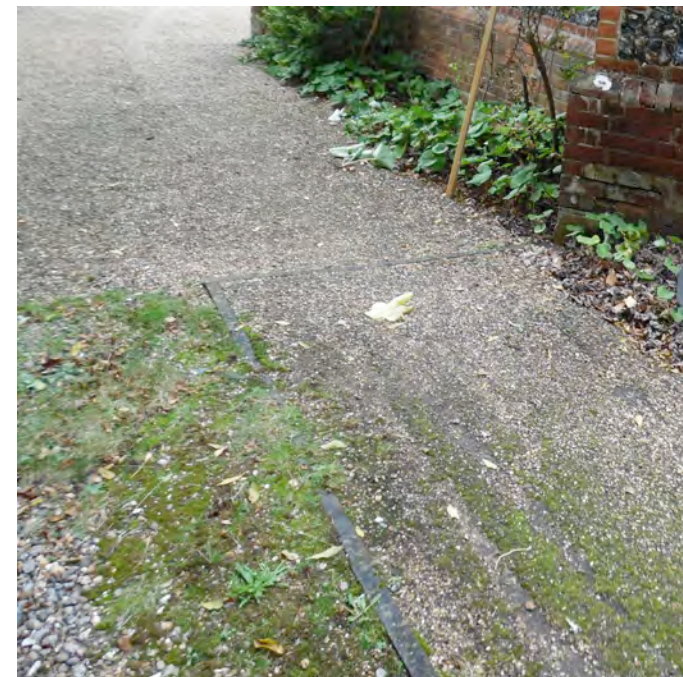
MF11 - Gravel Pathway