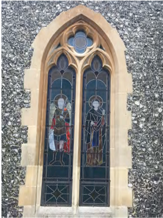
MF6 - Existing Stain Glass Windows To Be Relocated