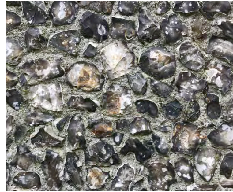
MF8 - Knapped Flint Facing