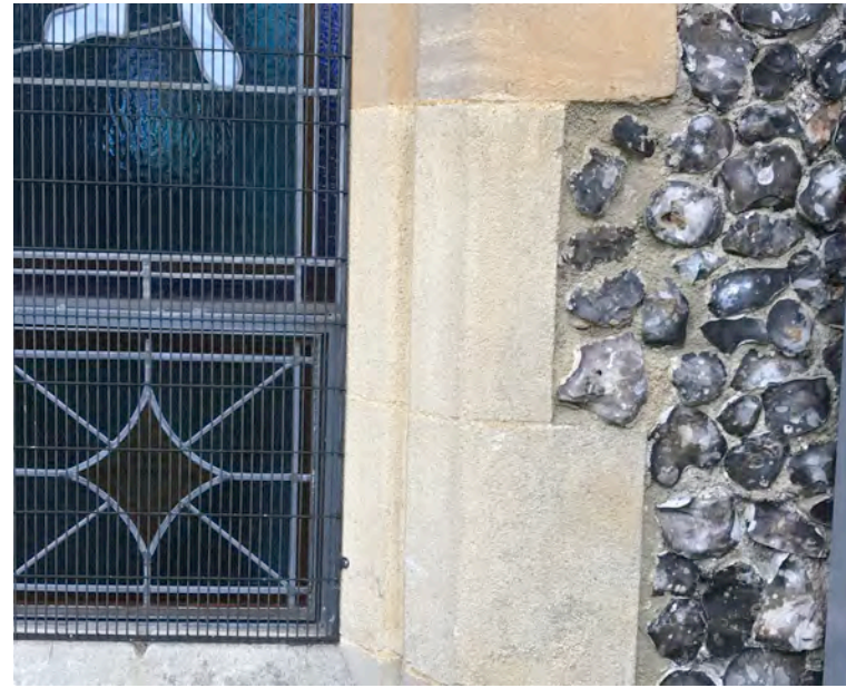
MF7 - Stone Detail and Quoins