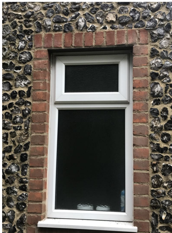
MF4 - UPVC Window