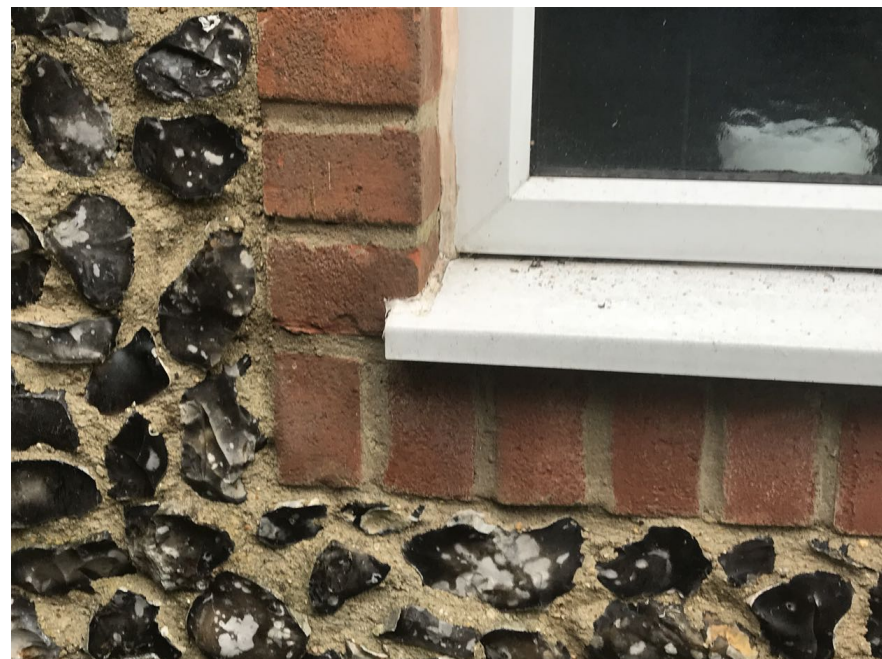
MF5 - Red Brick and UPVC Cill Detail