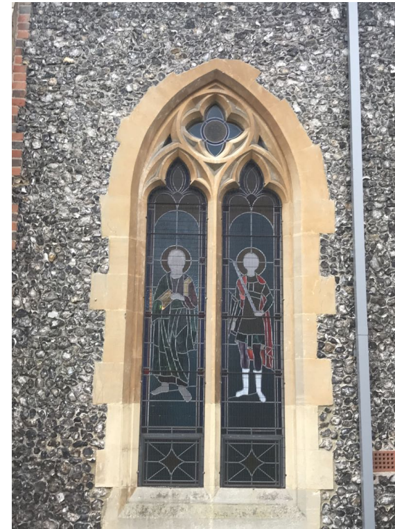
MF3 - Square Section Mid Grey Powder Coated Aluminium Gutters and Rainwater Pipes