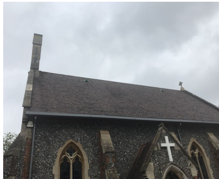
MF2 - Pitch Roof Finish