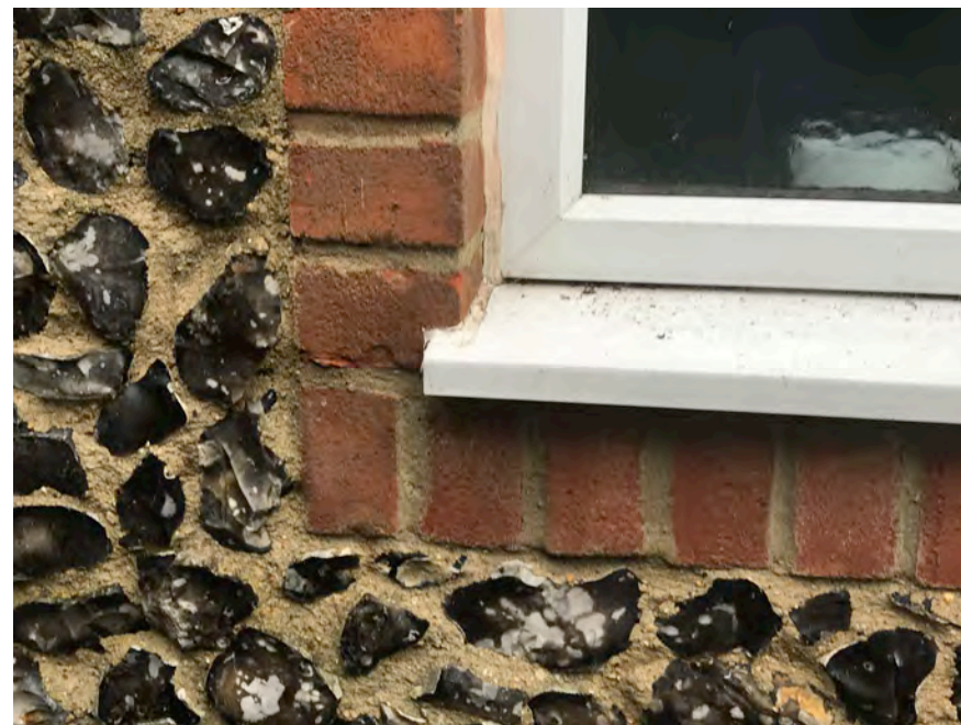
MF5 - Red Brick and UPVC Cill Detail