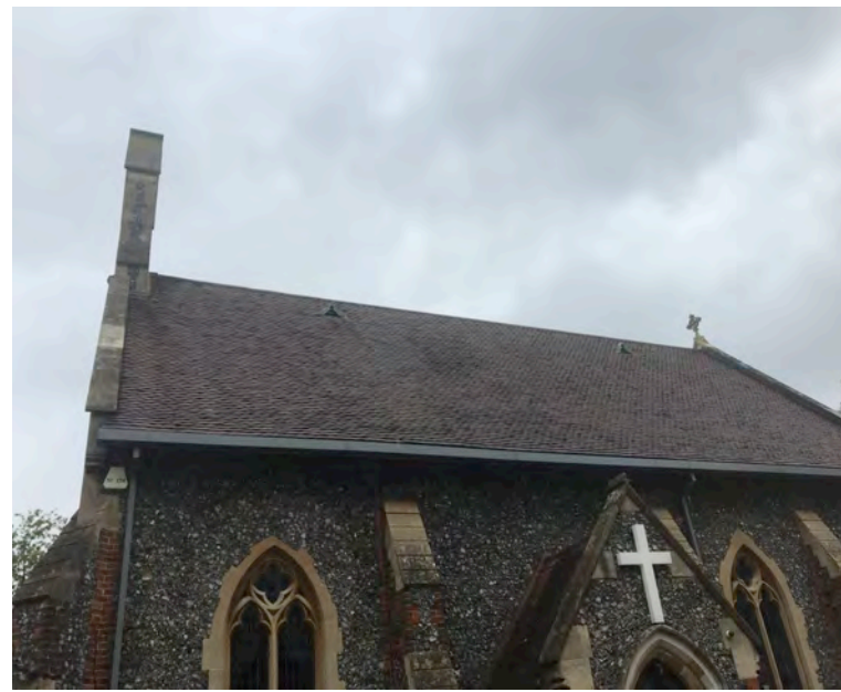
MF2 - Pitch Roof Finish