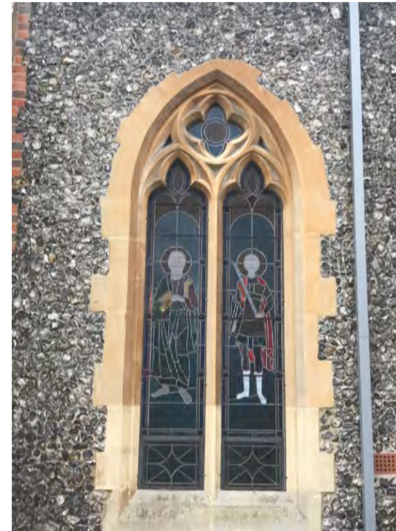
MF3 - Square Section Mid Grey Powder Coated Aluminium Gutters and Rainwater Pipes