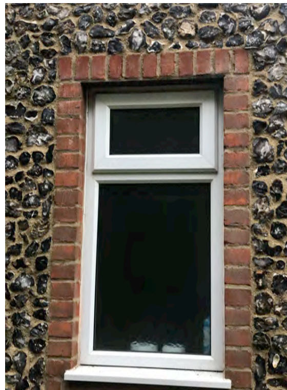
MF4 - UPVC Window