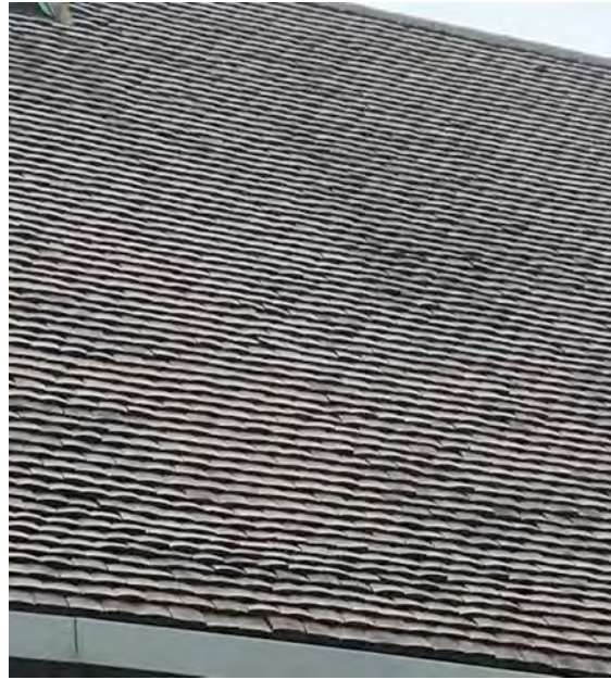
MF1 - Handmade Clay Roof Tiles Type Traditional Weathered From Cowden TBM LTD