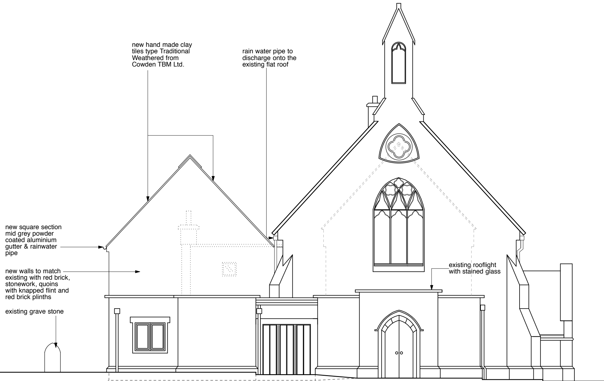
Proposed West Elevation

ONLY STATUS 'C' DRAWINGS TO BE USED FOR CONSTRUCTION PURPOSES