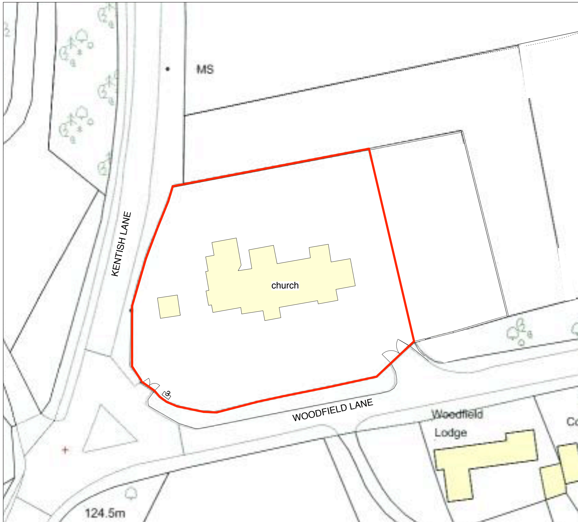
THE TWELVE APOSTLES CHURCH SITE PLAN scale 1:500