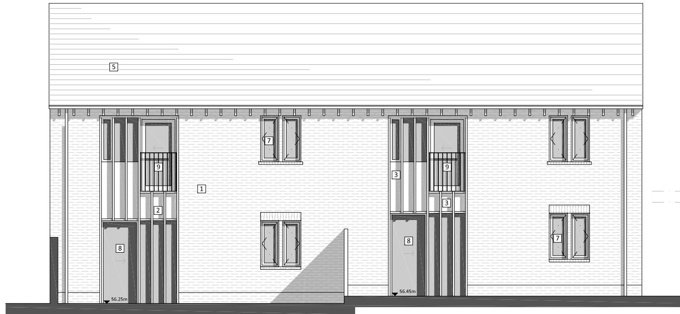
REAR (NE) ELEVATION