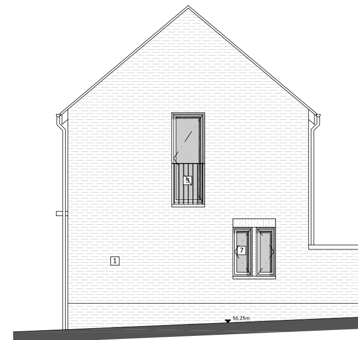
RH SIDE (SE) ELEVATION