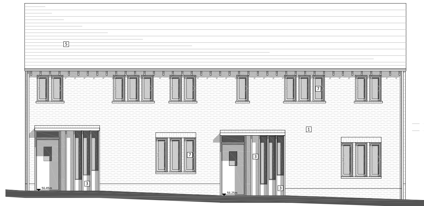
FRONT (SW) ELEVATION