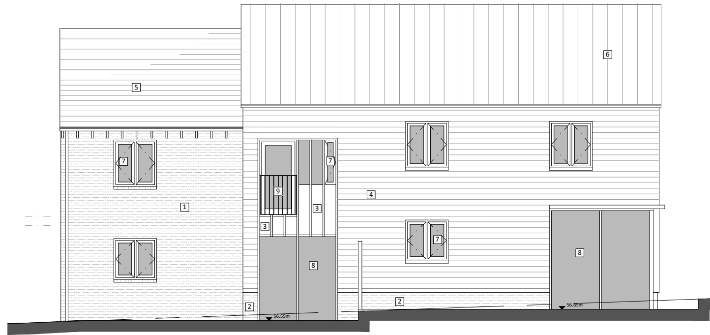
REAR (NE) ELEVATION