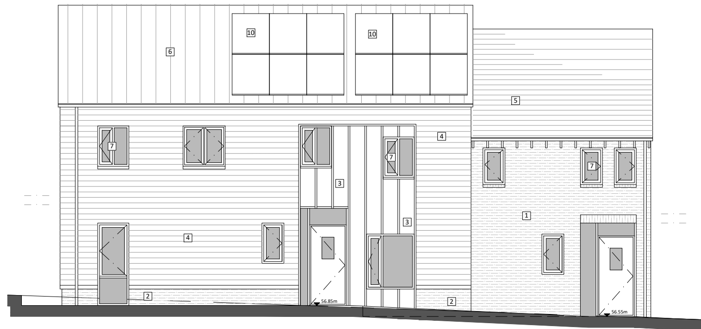
FRONT (SW) ELEVATION