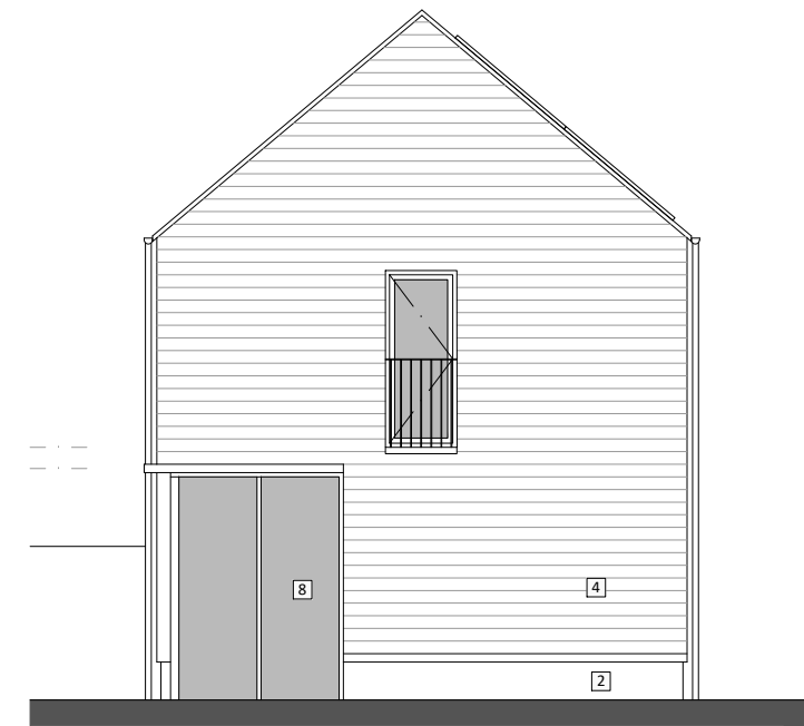
LH SIDE (NW) ELEVATION