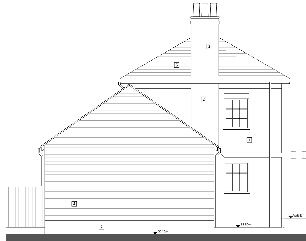
LH SIDE (SW) ELEVATION