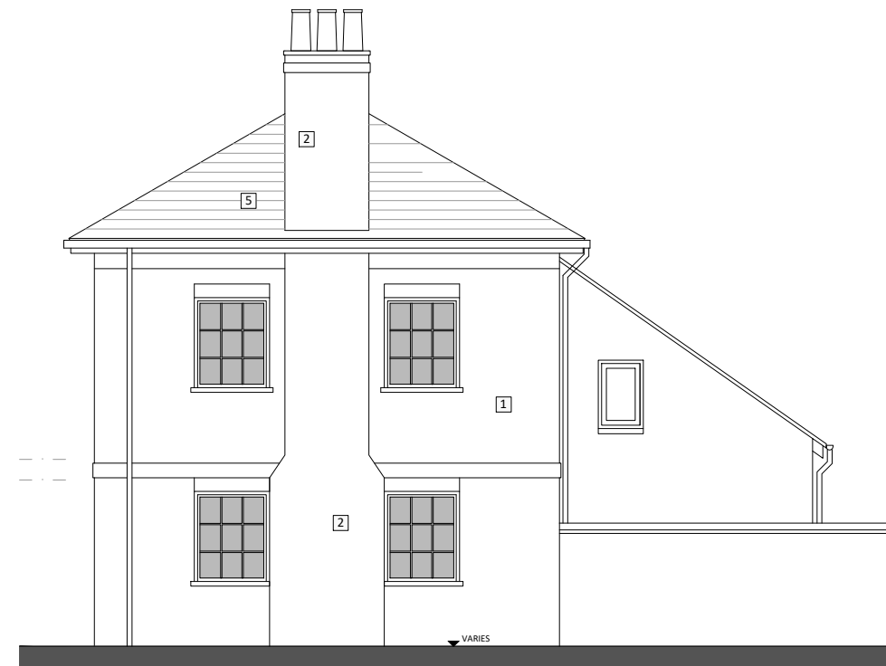
RH SIDE (NE) ELEVATION

NOTES CONSULTANTS - Refer to highways consultant's drawings for details - Refer to landscape consultant's drawings for details - Landscaping layout is indicative only AREAS - Refer to area schedule