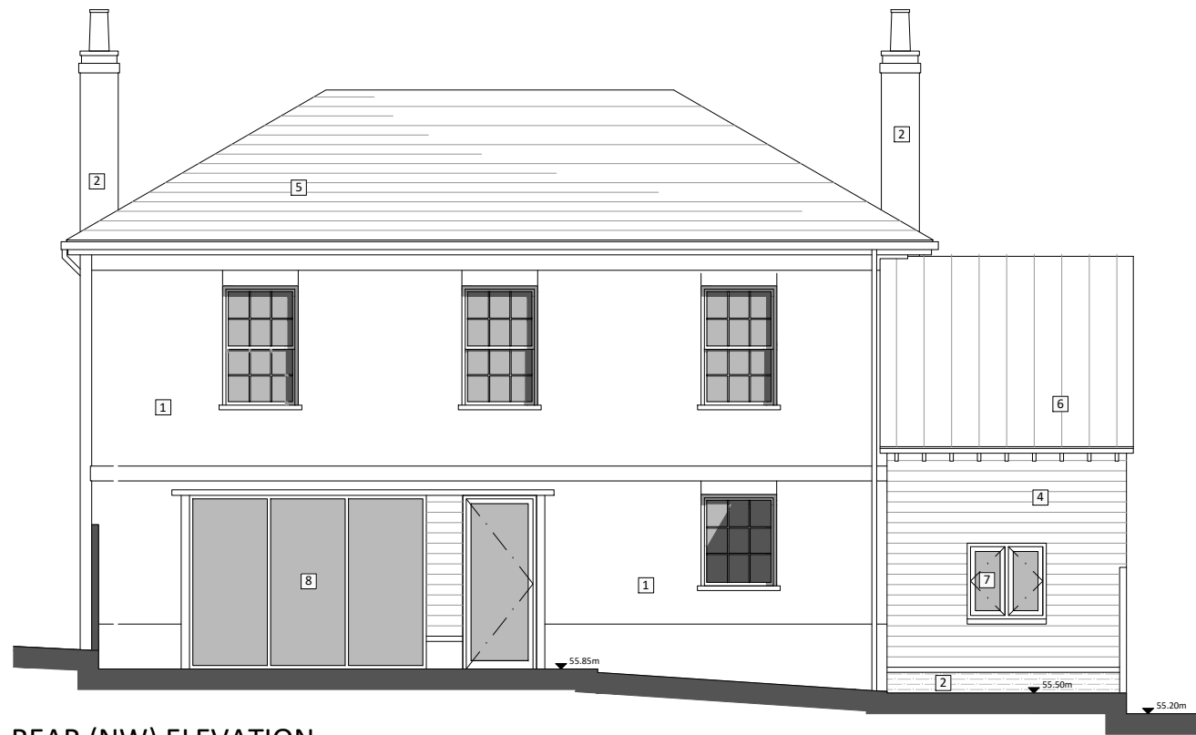
REAR (NW) ELEVATION