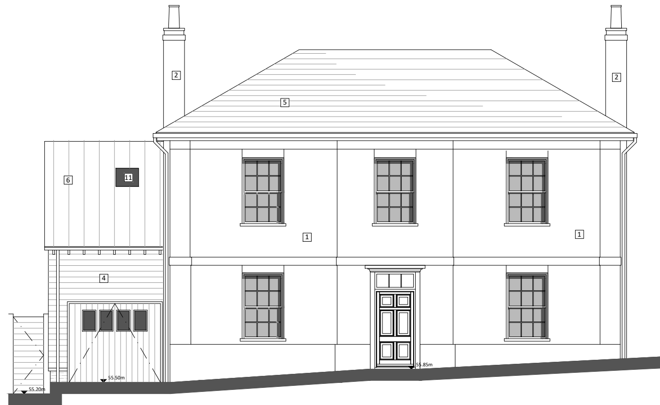
FRONT (SE) ELEVATION