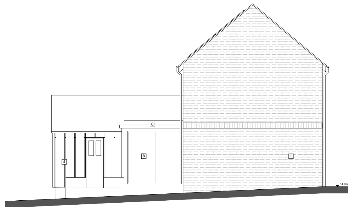
LH SIDE (SE) ELEVATION