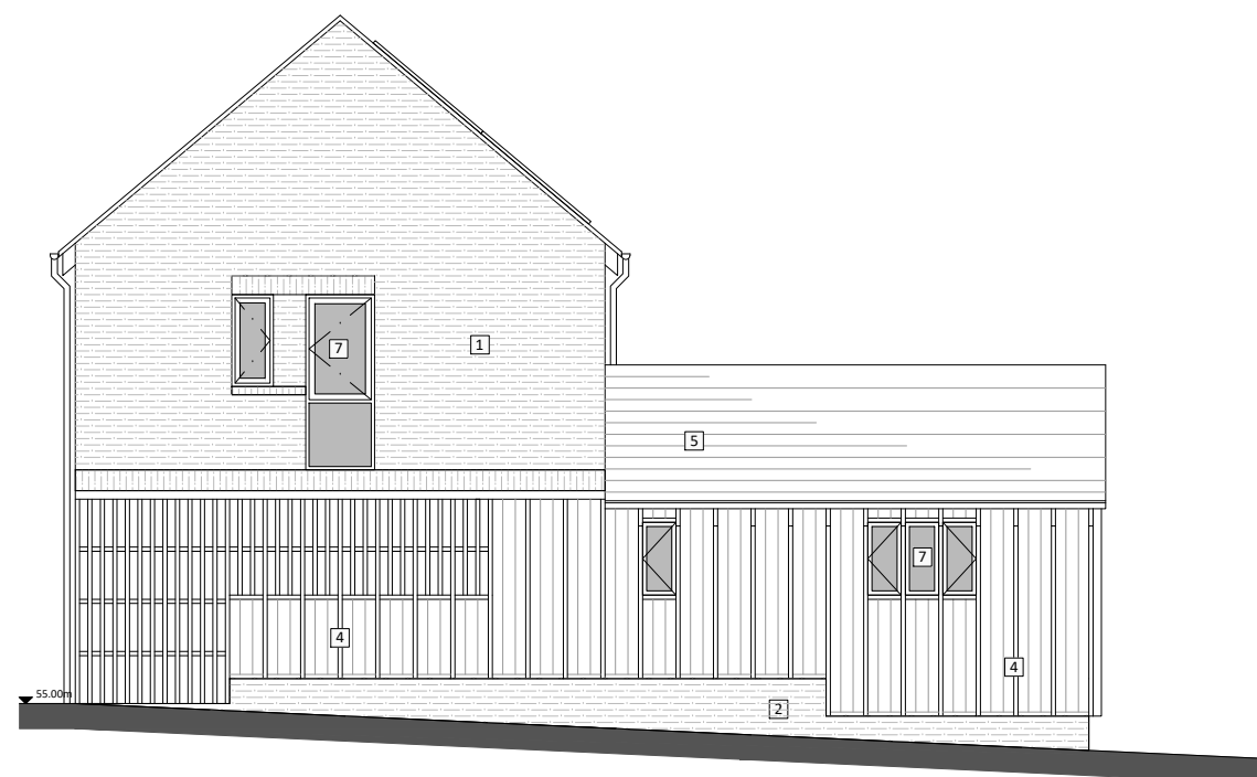
RH SIDE (NW) ELEVATION