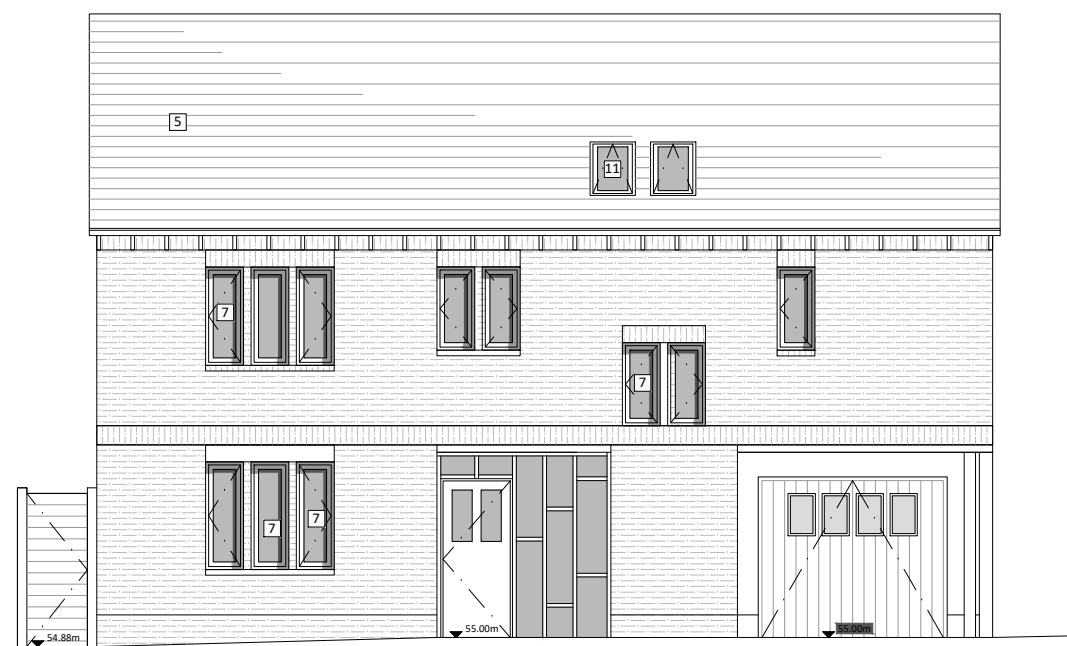
FRONT (NE) ELEVATION