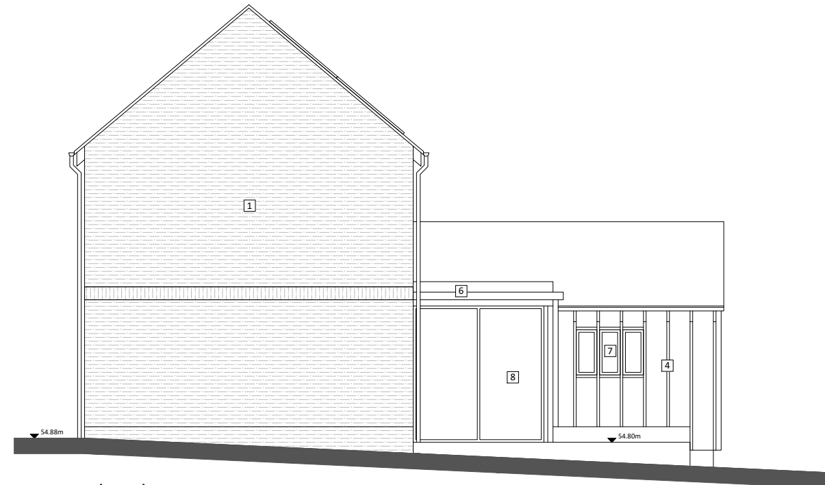
RH SIDE (NW) ELEVATION