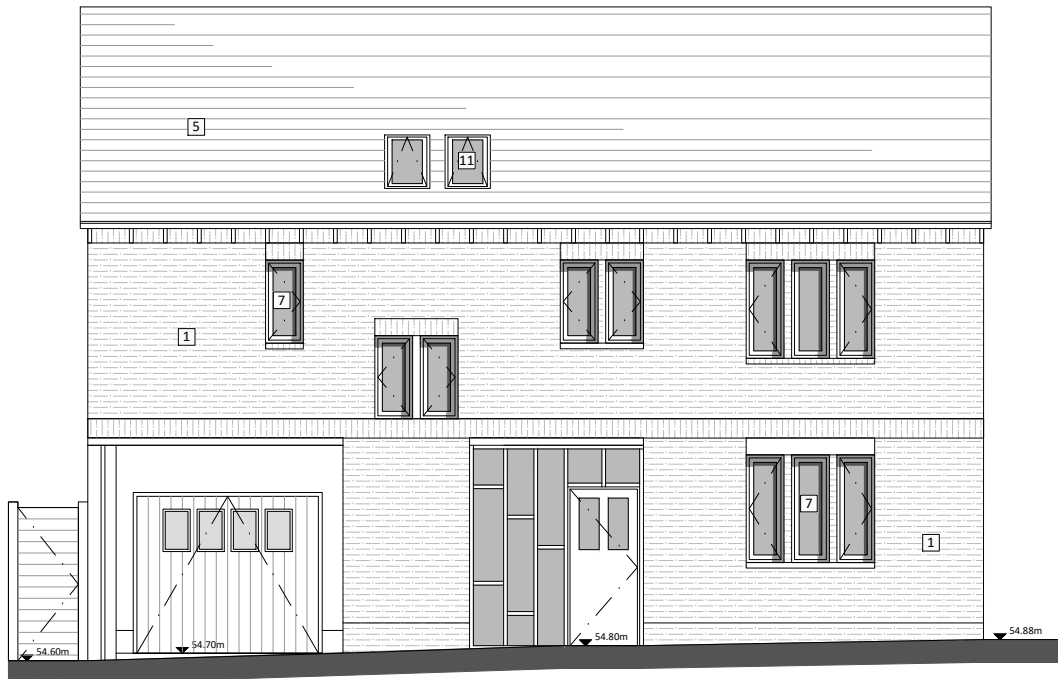
FRONT (NE) ELEVATION