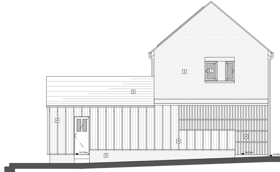
LH SIDE (SE) ELEVATION