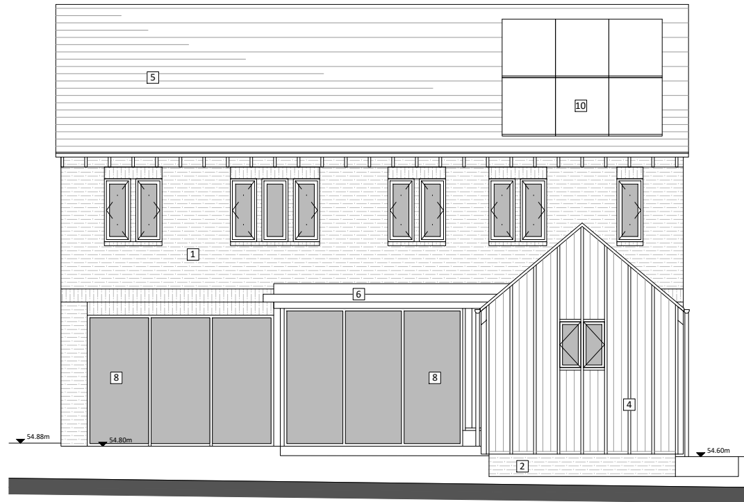
REAR (SW) ELEVATION