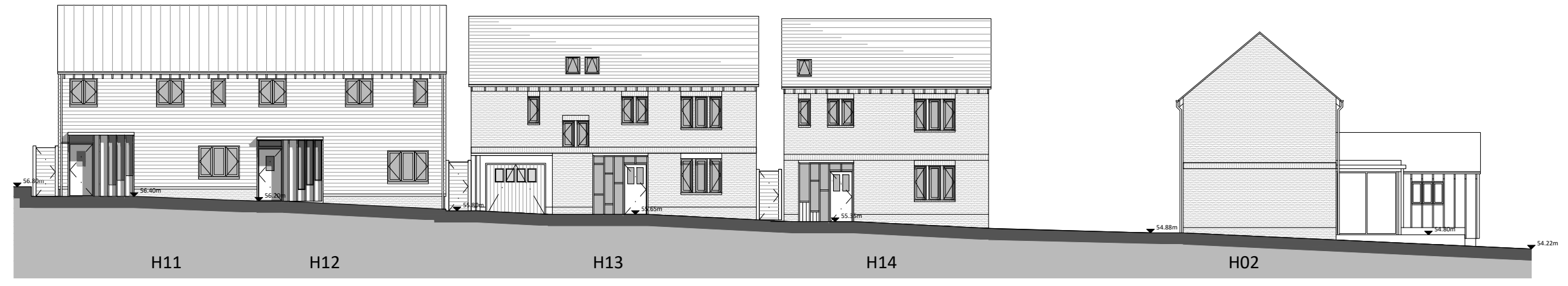
50.00m AOD SITE SECTION D - D

NOTES CONSULTANTS - Refer to highways consultant's drawings for details - Refer to landscape consultant's drawings for details - Landscaping layout is indicative only AREAS - Refer to area schedule