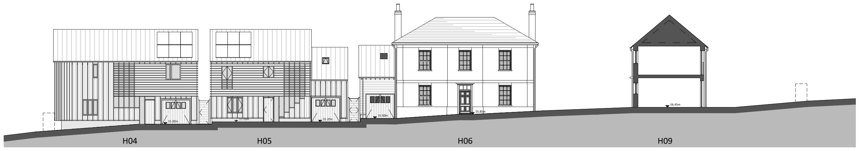
50.00m AOD SITE SECTION B - B

NOTES CONSULTANTS - Refer to highways consultant's drawings for details - Refer to landscape consultant's drawings for details - Landscaping layout is indicative only AREAS - Refer to area schedule