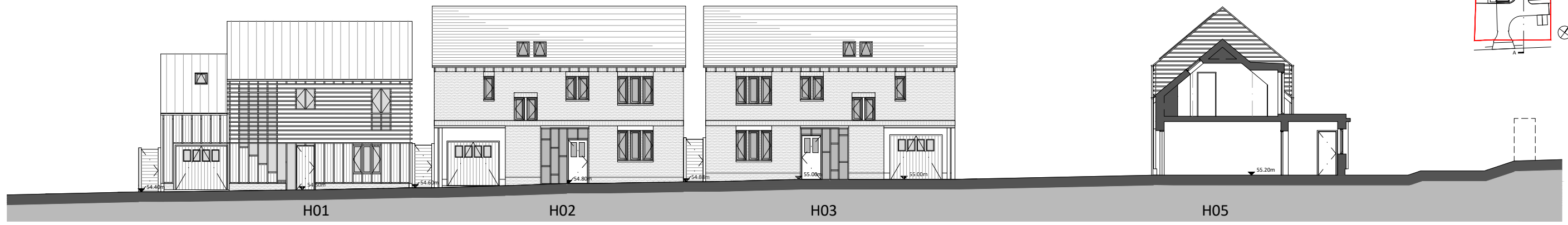
50.00m AOD SITE SECTION A - A