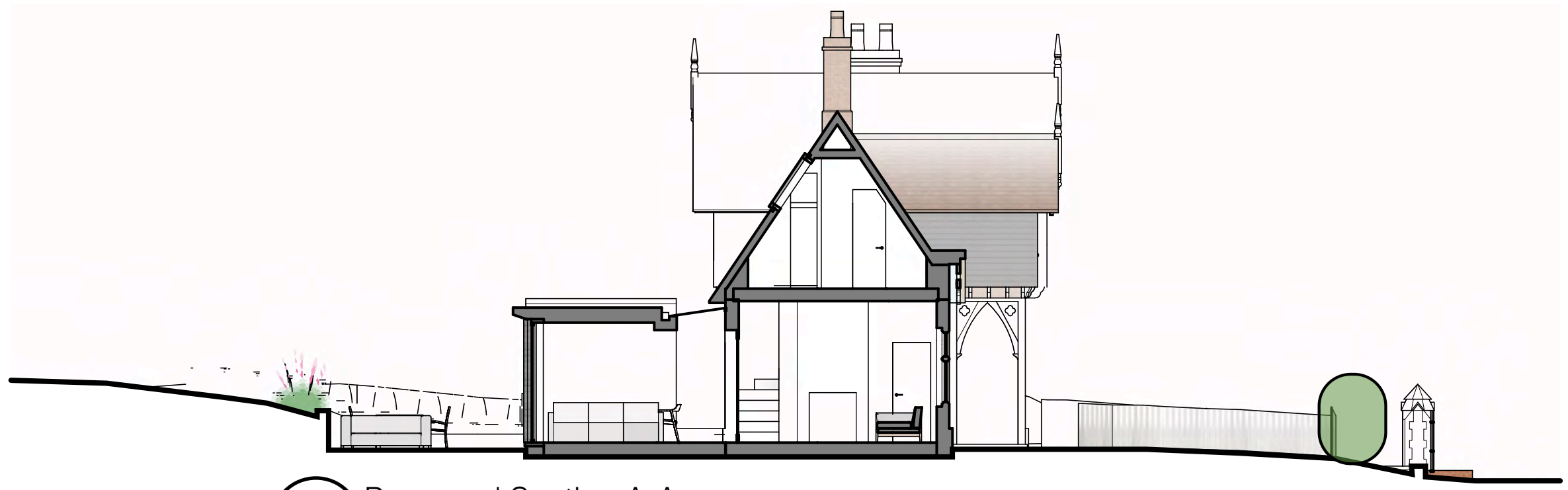
A Proposed Section A-A PL29 1:100