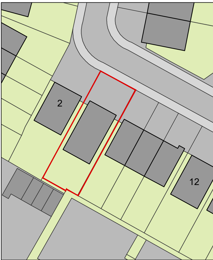
[02] BLOCK PLAN 1:500