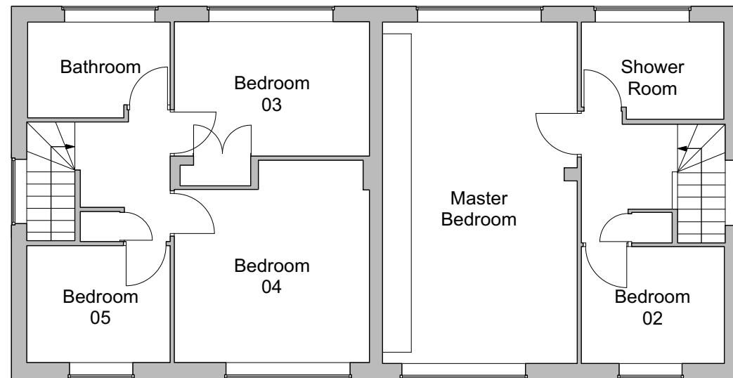
Existing First Floor