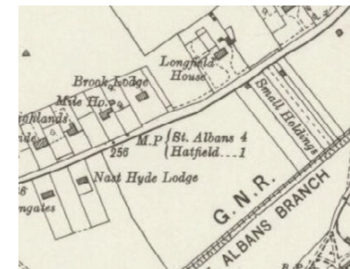
OS Map of Hatfield, 1922: the vacant site to the west of the Small Holdings

The existing hotel comprises the original building along with significant later extensions (1980s/90s) and provides 128 rooms along with conferencing facilities. Little of the original Art Deco interior survives to this day.