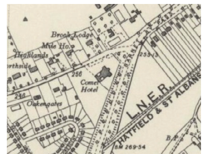
OS Map of Hatfield, 1937: the Comet Hotel and its 'plane shape' plan