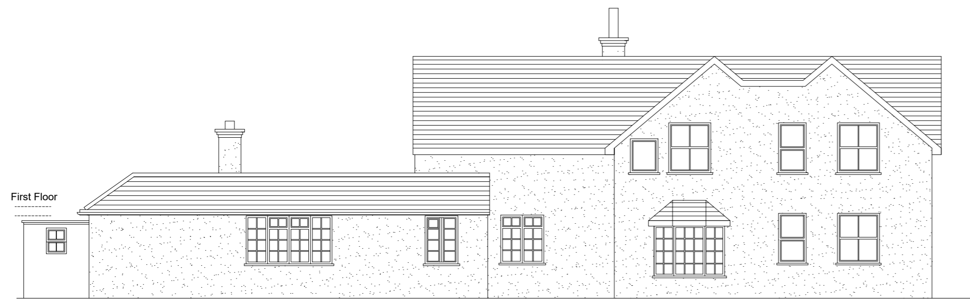
Rear Elevation as Existing