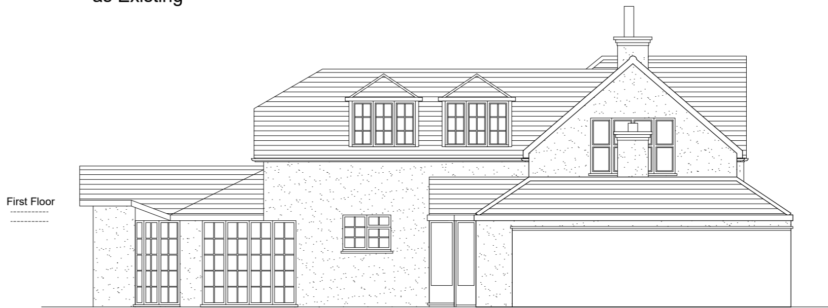
Flank Elevation as Existing