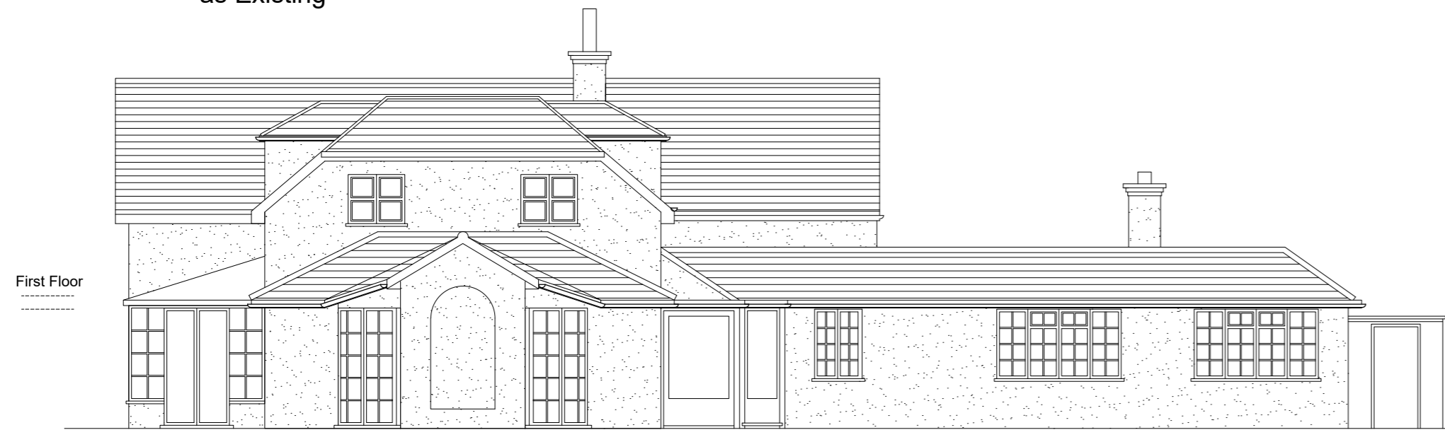
Front Elevation as Existing