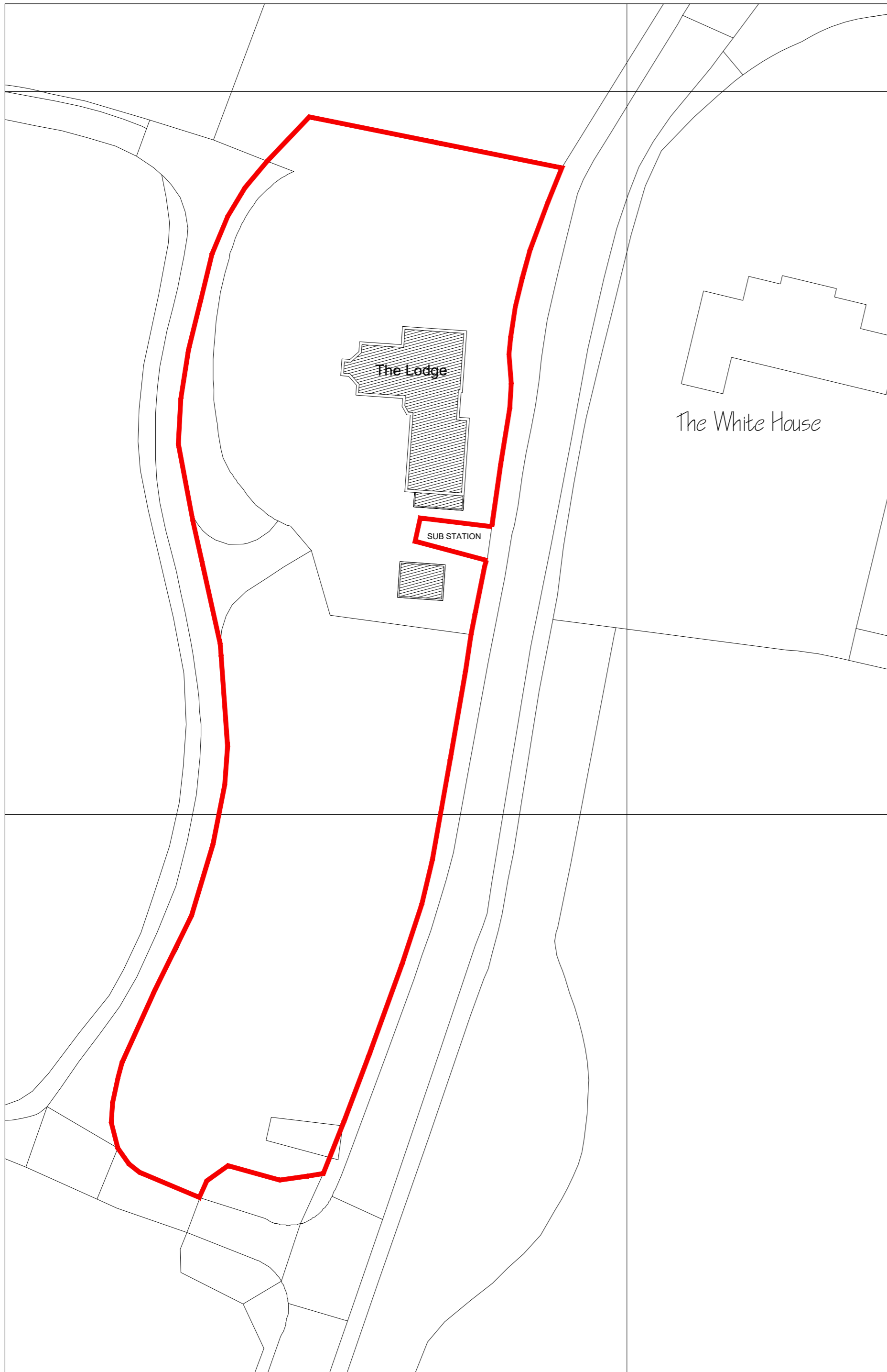
Site Plan as Existing