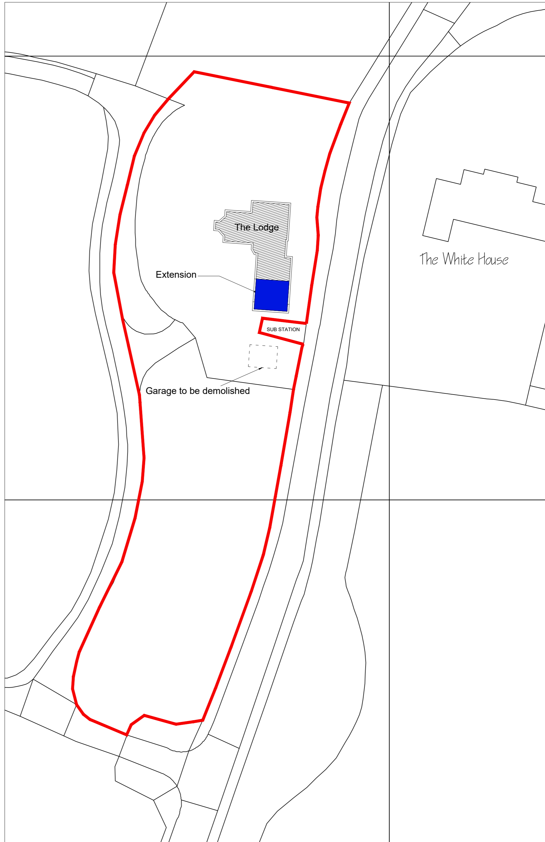
Site Plan as Proposed