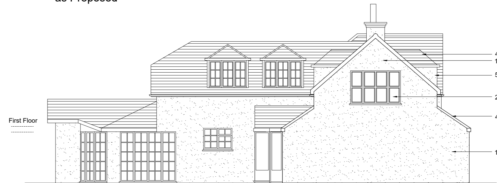
Flank Elevation as Proposed