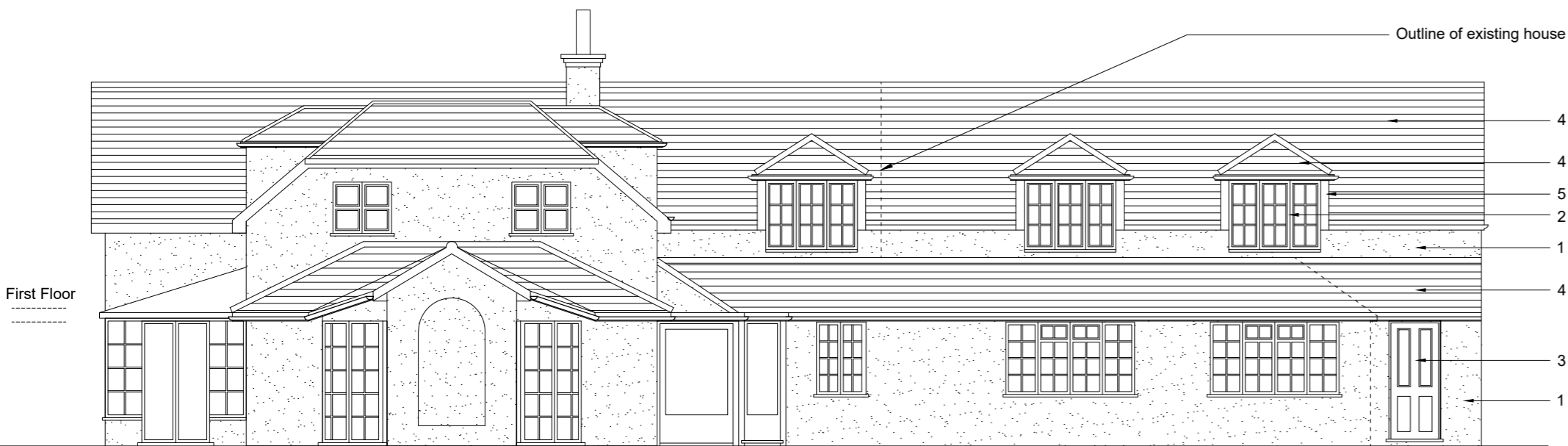
Front Elevation as Proposed