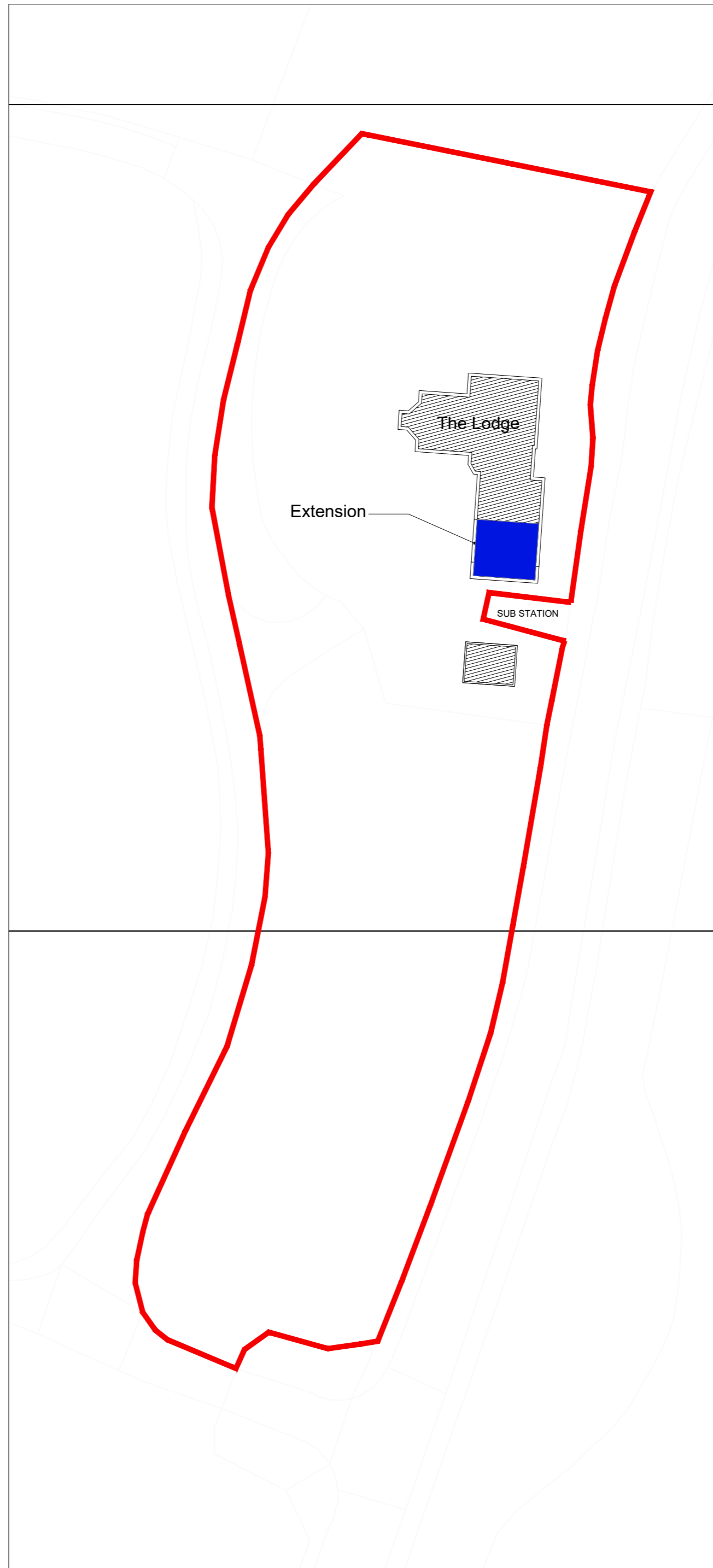
Site Plan as Proposed