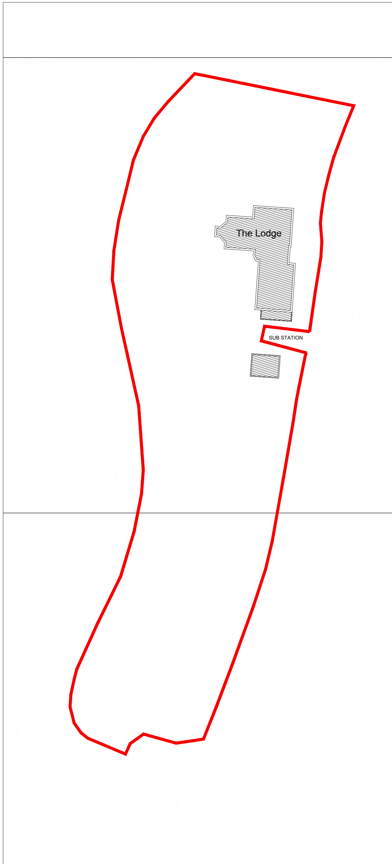
Site Plan as Existing