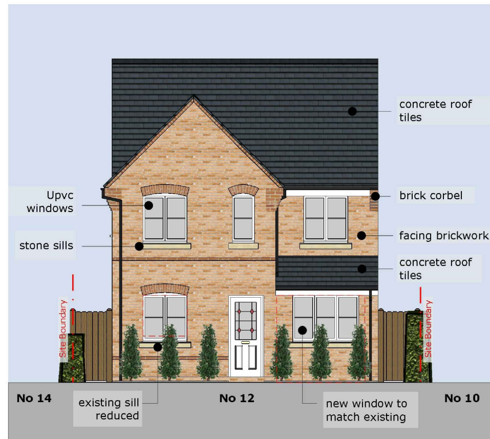
[02] PROPOSED FRONT ELEVATION (NORTH) 1:100

the contractors are to check all dimensions, drain runs and general conditions on the site before works commence, and inform ARGENTO DESIGN STUDIO immediately upon discovery of any errors, omissions or discrepancies. all works are to be carried out in accordance with current building regulations, british standards, code of practice and local authority requirements. This drawing must be read together with the specification, bill of quantities and related drawings.